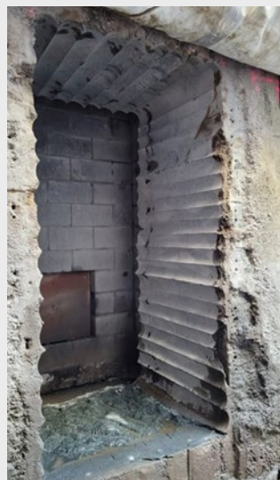
Breakthrough from the retrieval shaft base through to the T8 Airport Line Tunnel.