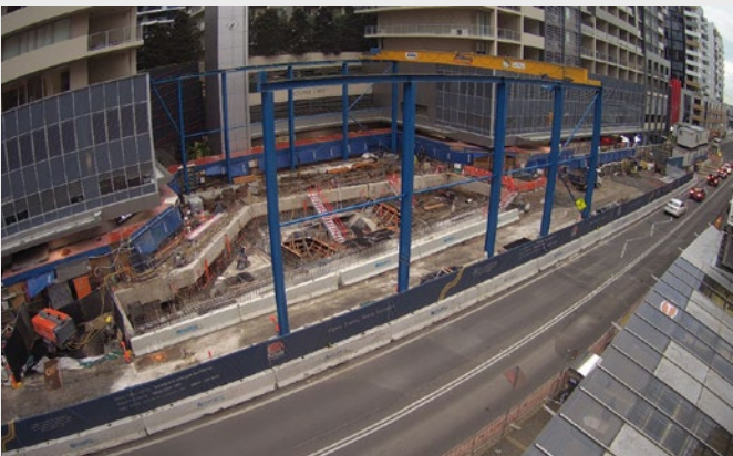
View of the Mascot Station Access upgrade work showing progress on the ground floor slab construction.