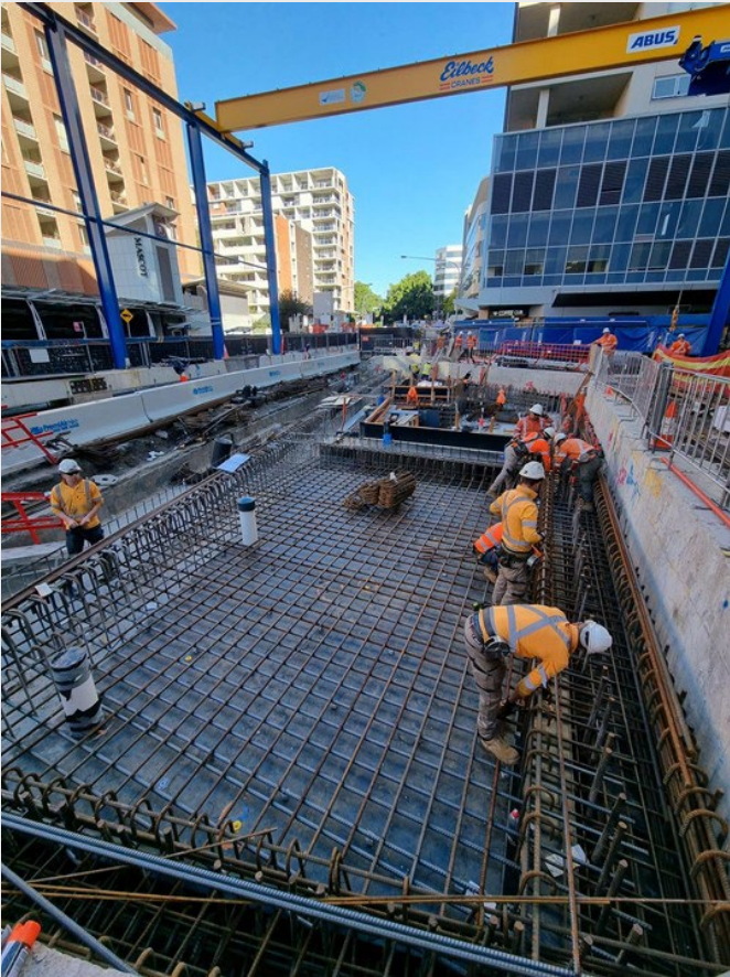
Steel fixing the ground floor slab on the Mascot Station Access upgrade work.