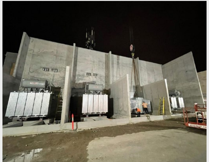
All substation power transformers delivered and placed in position for future cable connection.