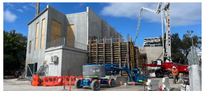
Progress on the substation.

Works within the station also progressed well, with the team completing the demolition of the old male and female toilets, installation of services and laying of additional tiles within the concourse area. This will now allow the team to commence installation of the revised gate line, which will result in a doubling of the Opal gate capacity at Mascot Station.