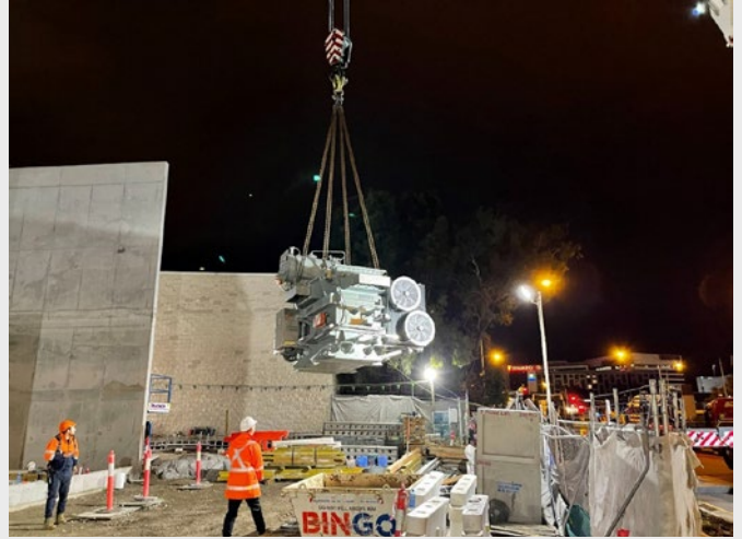
Substation power transformer being craned into the 166 O'Riordan Street substation site.