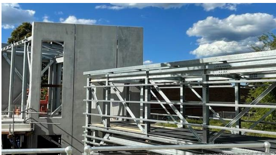
Newly installed cable bridge connecting the northern and southern substation buildings at 166 O’Riordan Street

The cycle lane on Bourke Street between Coward Street and Gardeners Road will remain closed until the end of the Mascot Station Upgrade project in early 2023.