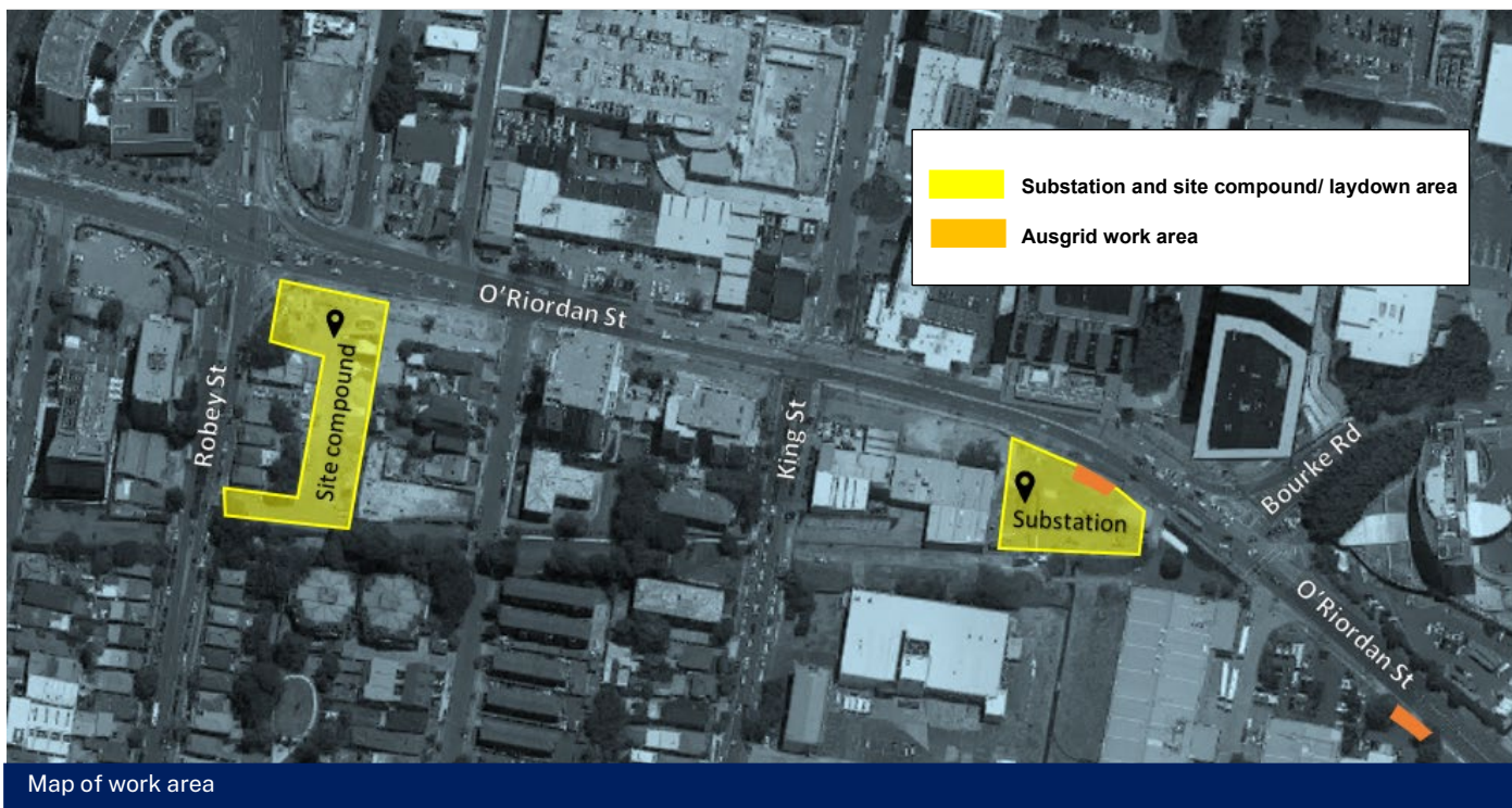
Map of work area