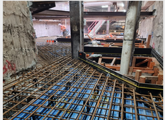
Installed reinforcement on upper concourse.