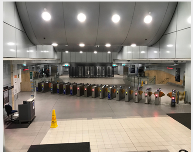
New gate line arrangement.