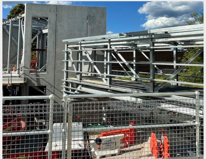
Mascot substation cable bridge -work in progress.