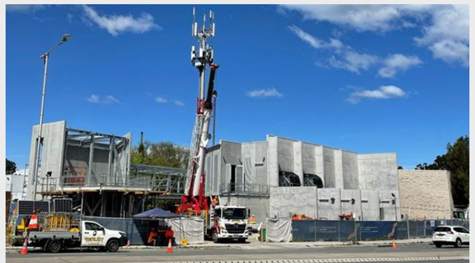
Mascot substation -work in progress.