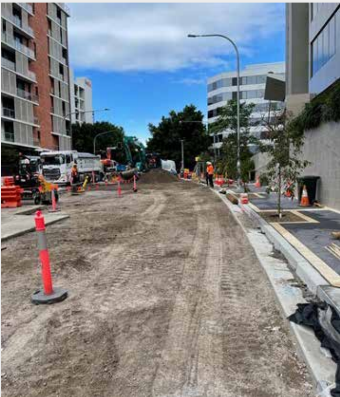
Work in progress: preparation works for asphaltting.

During August the Mascot Power Supply Upgrade project team restored and reopened the western roadway and footpath on Bourke Street (between Coward and John streets). We have captured some of the work progress below.