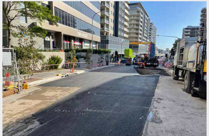
Work in progress: asphalt being rolled.