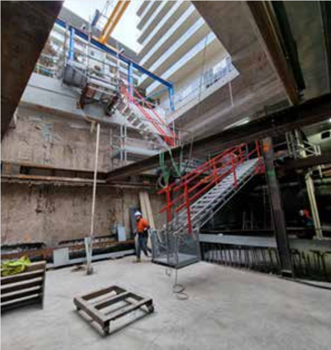
View of the new western entry from the upper concourse level with temporary support beams in place.