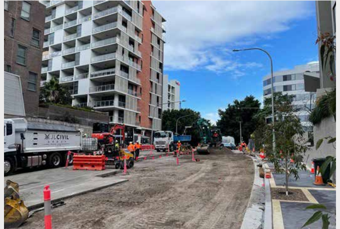
Work in progress: pathway complete and preparation works for asphaltting.

As we advised in the July and August Mascot Precinct Update notification, work on the Mascot Station Access upgrade had been adversely affected by the impacts of COVID on the workforce over the last 18 months, together with the extreme rain events that we have encountered. To make up lost time and the impact on our construction program we are extending Saturday hours to 6pm. This change took effect from Saturday 23 July 2022 and will remain in place through to project completion.