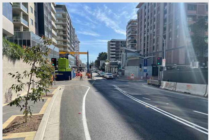
Western Bourke Street roadway and pathway reinstated.