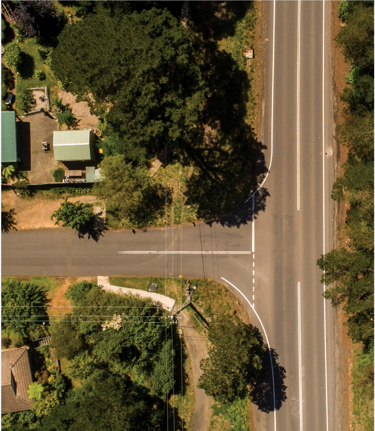
Aerial view of Bellevue Avenue, Medlow Bath