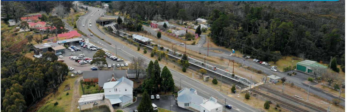
The proposed Medlow Bath Upgrade minimises residential property impacts

Together the Australian and NSW Governments are investing more than $4.5 billion towards upgrading the Great Western Highway between Katoomba and Lithgow. The Great Western Highway Upgrade will reduce congestion, deliver safer, more efficient and reliable journeys for those travelling in, around and through the Blue Mountains, and better connect communities in the Central West.