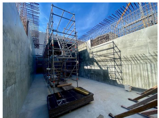
View from inside the new underground bogie exchange tunnel, July 2021

Work has also started on upgrading the electrical substation to support an increased electrical capacity required for the new automated bogie exchange system.