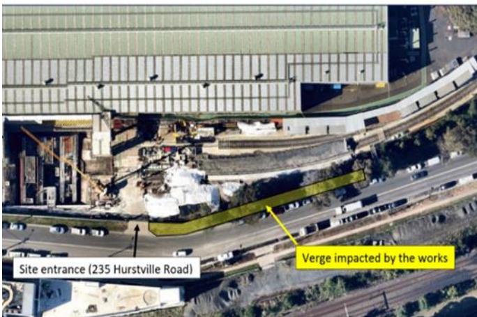
Exclusion zone off Hurstville Road indicated in yellow

In preparation for construction of a new site access entrance off Hurstville Road, we will be sectioning off an exclusion zone on the verge beside the existing Centre boundary fence (as indicated in the image below).