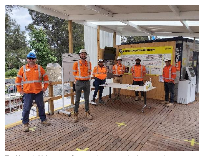
The Mortdale Maintenance Centre project team and subcontracted concrete supplier meet on-site to identify a more sustainable approach to construction.

After investigating the technical suitability of various concrete mixes, the project team have identified a more sustainable mix through consultation with the supplier, subcontractor, design and construction teams. The nominated mix helps reduce the carbon footprint of the concrete used on site by 16%.