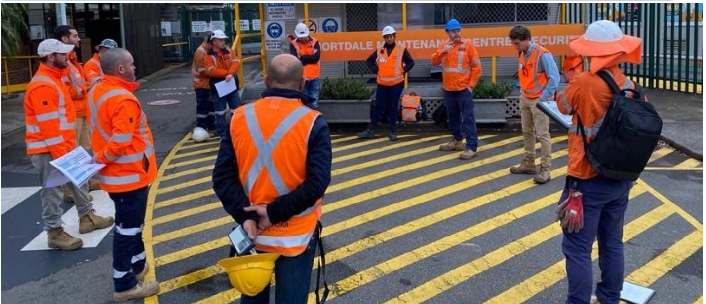
Project team on site during a pre-start briefing in October