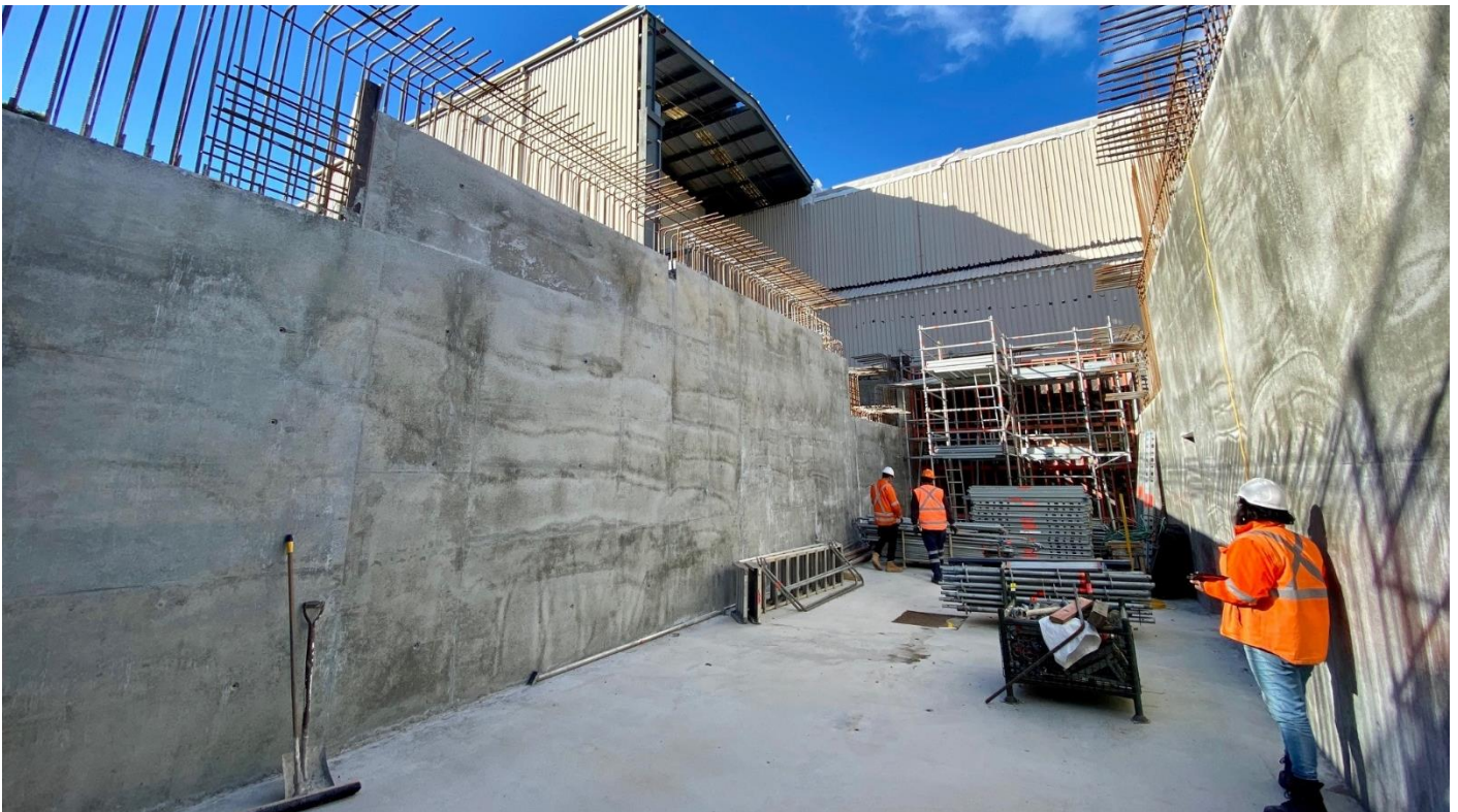
An image showing inside the Northern Bogie Exchange Tunnel, before roof slab installation.