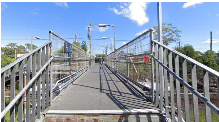
Figure 2: Mt Colah Station Pedestrian footbridge