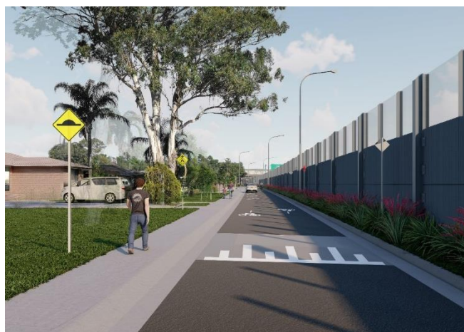
Proposed view looking south on Hutchinson Crescent (indicative only)