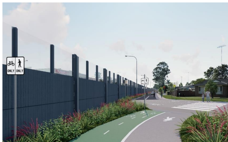
Proposed view looking north from cycle lane (indicative only)