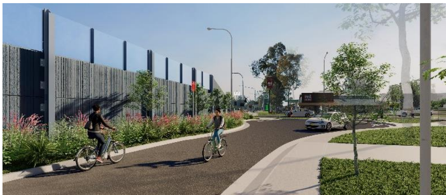
Proposed view looking north from footpath to Peter Court (indicative only)

The noise wall is likely to provide some shading, but won't shade front yards of properties in this area.