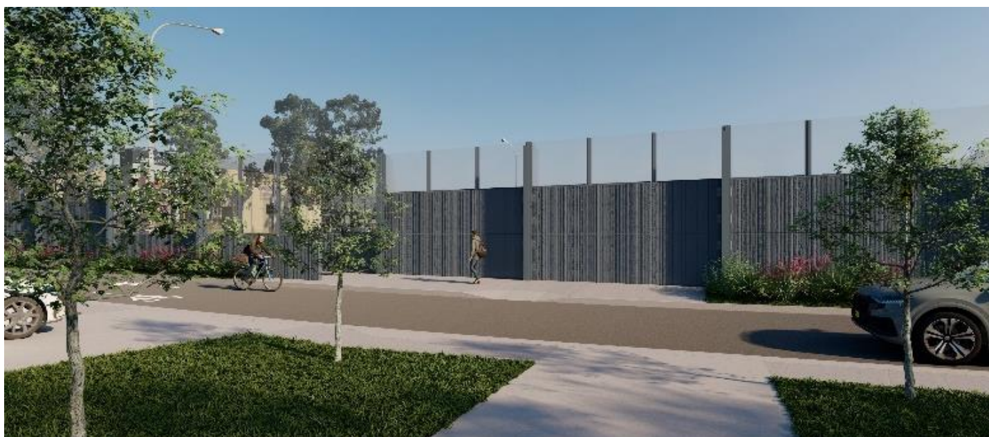
Proposed view of new noise wall and street arrangement from a driveway on Hutchinson Crescent looking towards Mulgoa Road (indicative only)

Transport for NSW acknowledges the Dharug people as the Traditional Custodians of the lands on which we work and pays respects to Elders past and present