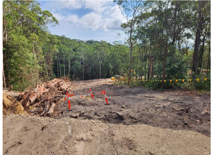
Image 6: Southern end Progressive installation of ERSED controls during clearing for construction main works ERSED controls