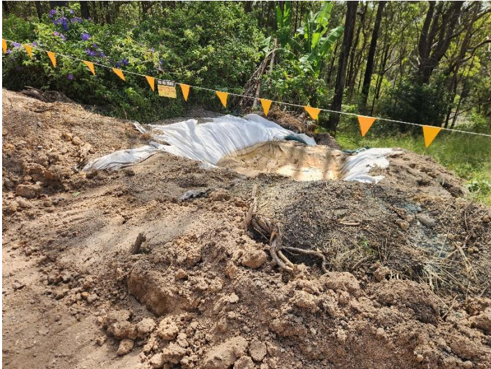
Image 5: Southern end progressive installation of ERSED controls during clearing for constructing main works ERSED controls and sediment basins