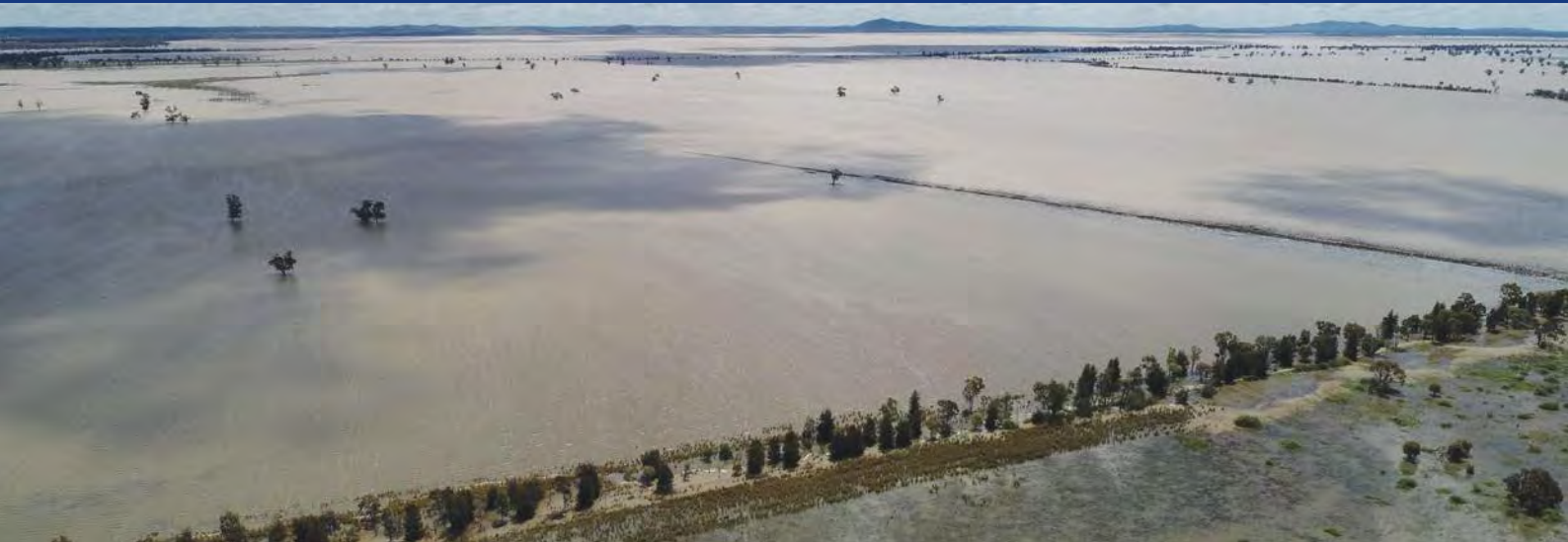
Aerial view of flooding at Marsden showing the Newell Highway in the foreground, 27 October 2022

The Australian Government and the NSW Government have committed to flood mitigation works on the Newell Highway between West Wyalong and Forbes.