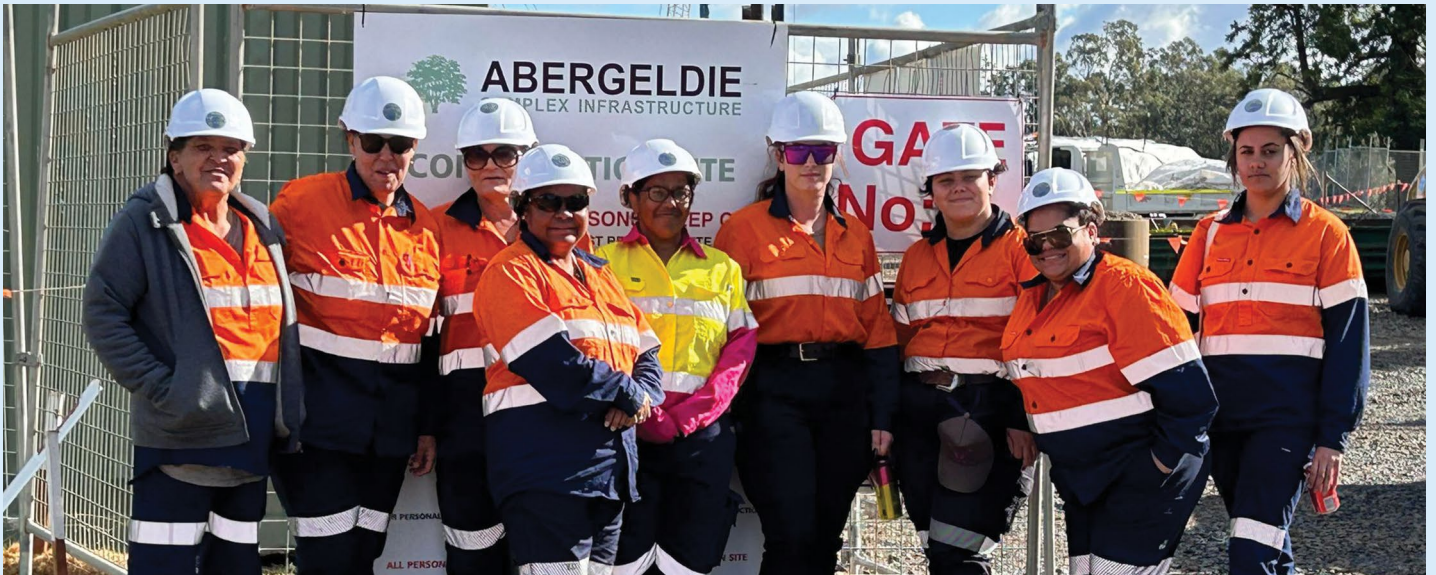
Sista's in Trade at the New Dubbo Bridge site on River Street

During the week-long work experience, the participants had the opportunity to immerse themselves in the New Dubbo Bridge construction site. They shadowed supervisors, took part in a safety walk, conducted a letterbox drop, and participated in a stone survey. The team greatly enjoyed sharing their knowledge and experience, including insights into what it means to be a woman in the construction industry. It was a rewarding experience for both the students and our team.