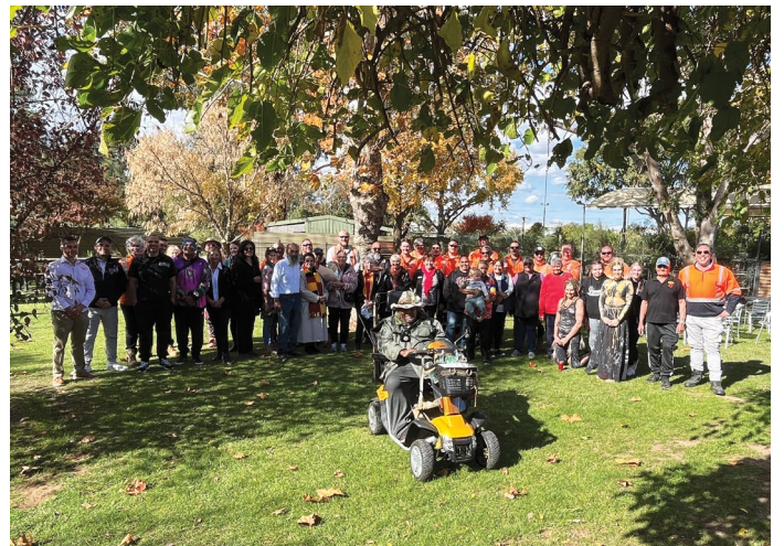
The project team with guests and participants in the ceremony