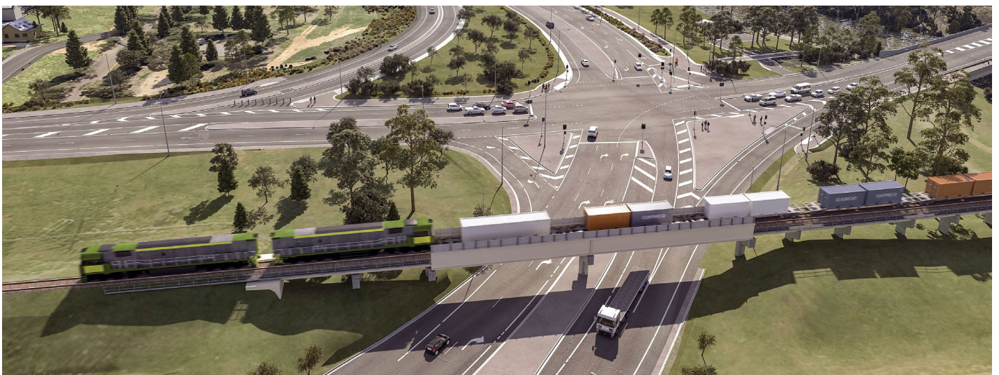
Artist impression of the New Dubbo Bridge from Whylandra Street