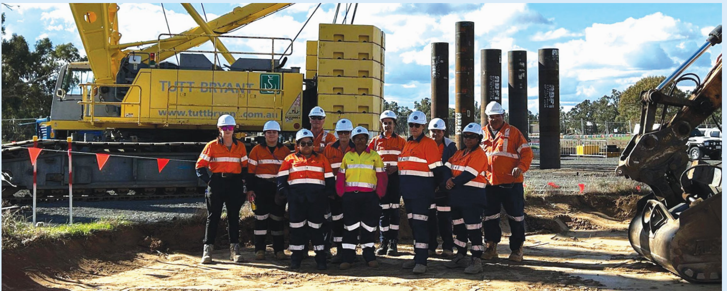
Sista's in Trade at the New Dubbo Bridge site on River Street