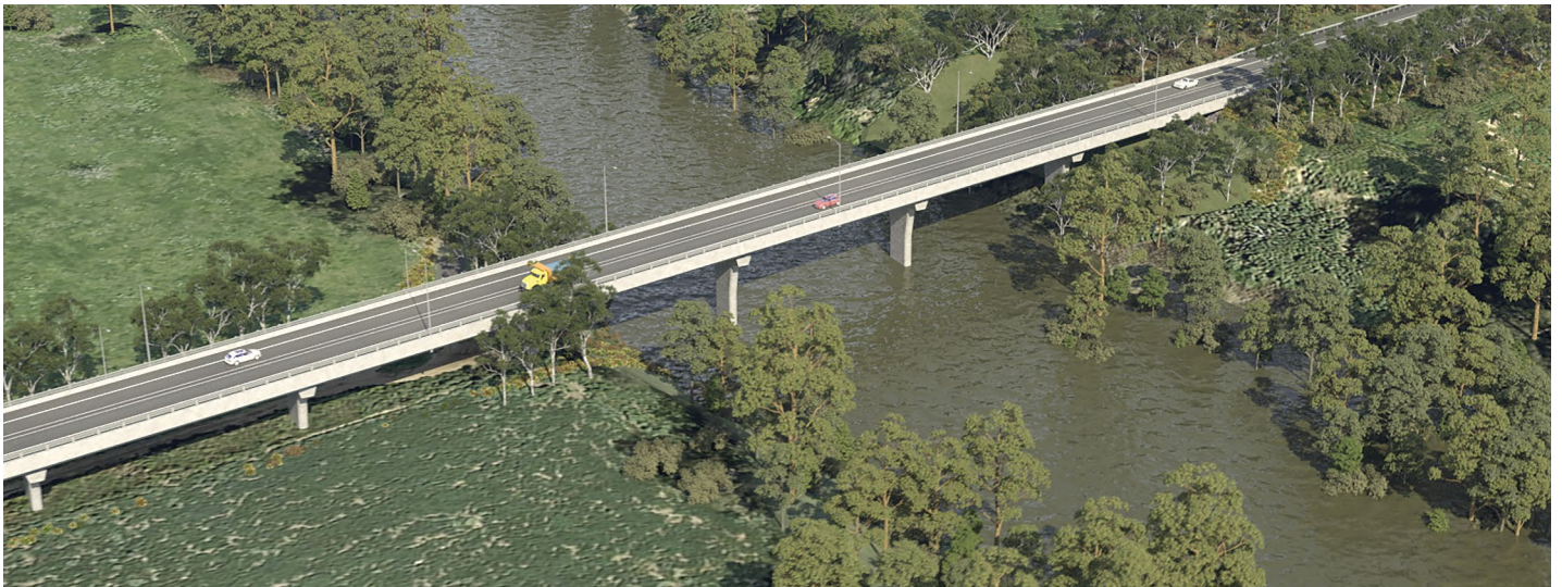
Artist impression of the New Dubbo Bridge from River Street