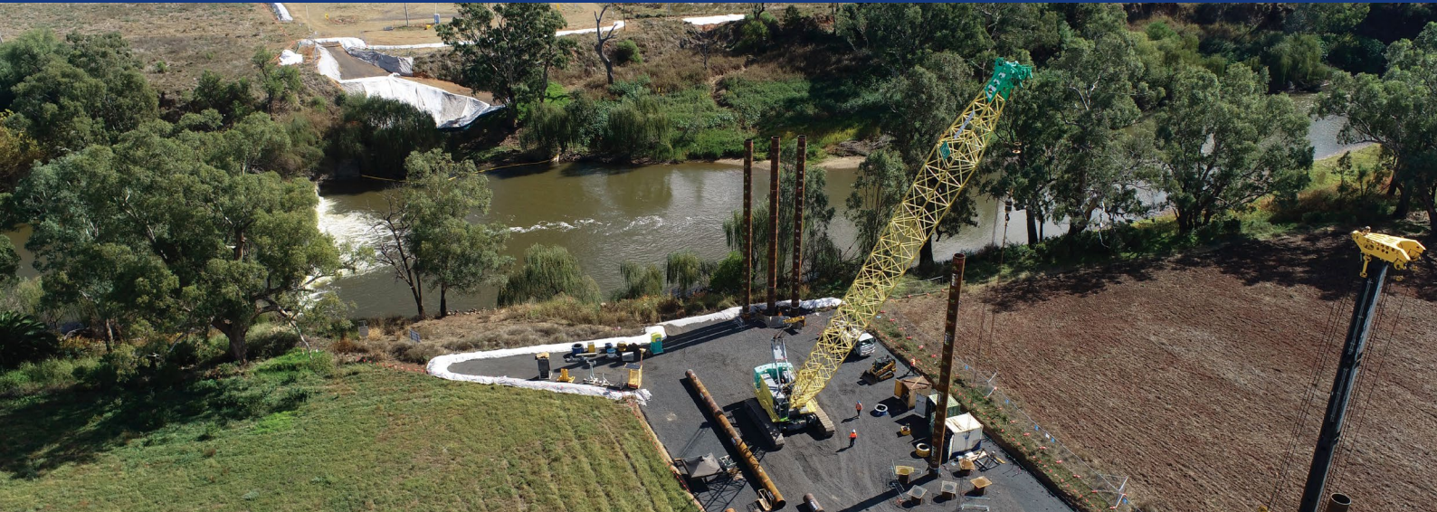
Piling on River Street adjacent to the Macquarie River

The Australian Government and the NSW Government have committed $220.2 million to build the New Dubbo Bridge project. The project aims to reduce traffic congestion in Dubbo and enhance access across the Macquarie River, particularly during flood events.