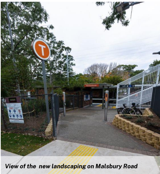
View of the new landscaping on Malsbury Road

We would like to thank the community for their continued support and cooperation during the upgrade of the Normanhurst Station, providing passengers with an accessible, secure and integrated station.