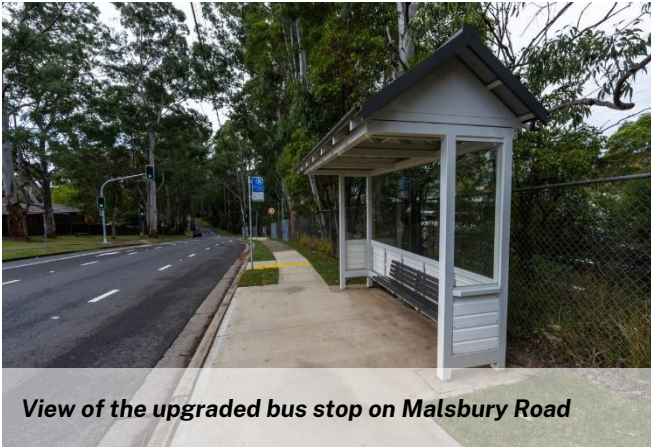
View of the upgraded bus stop on Malsbury Road