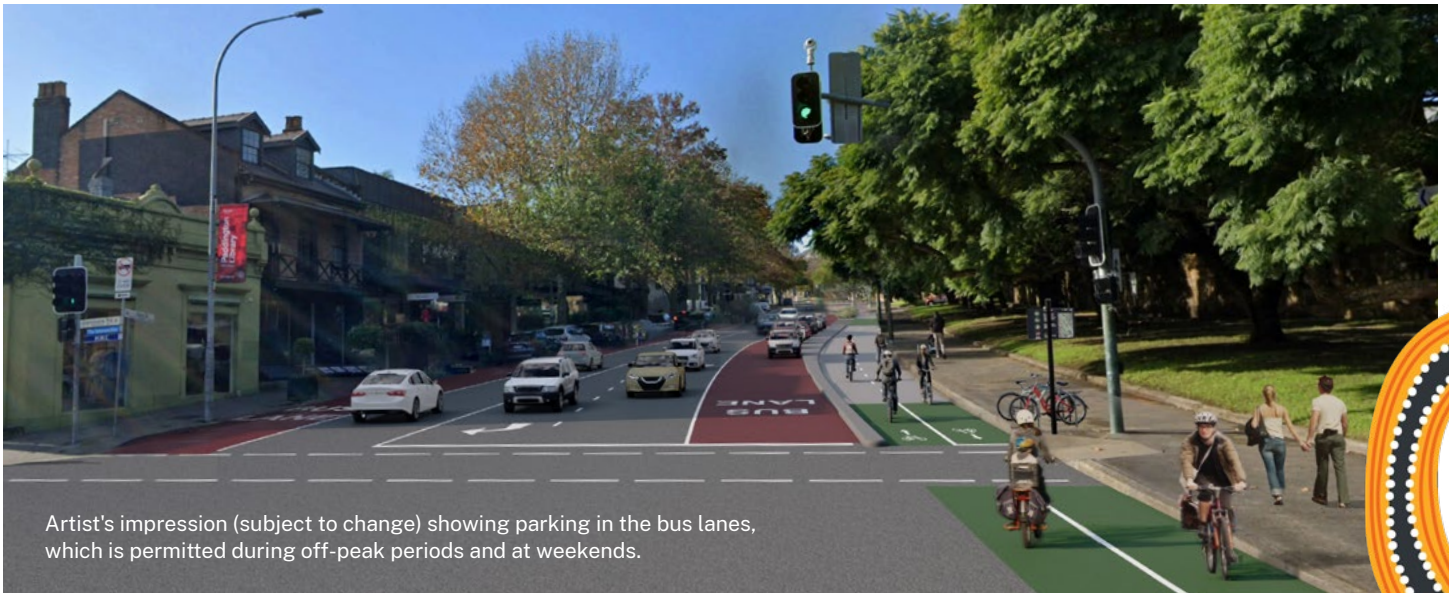
Artist's impression (subject to change) showing parking in the bus lanes, which is permitted during off-peak periods and at weekends.