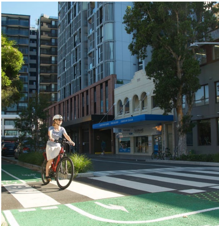
Bike riding on Spring Street, Bondi Junction