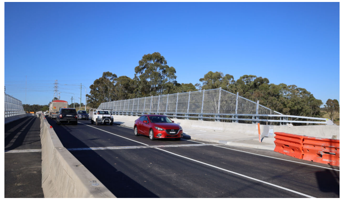
Traffic on the new Great Western Highway Bridge northbound

Pedestrians and cyclists will be detoured via northbound side of Prospect Highway.