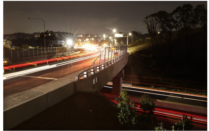
Opening of the duplicated bridge of the M4 Motorway