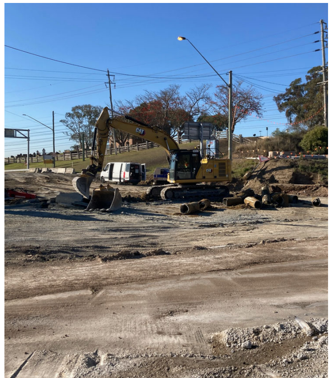
Pavement works at Prospect Highway and Ponds Road intersection

For the latest traffic updates, call 132 701 , visit livetraffic.com or download the Live Traffic NSW App.