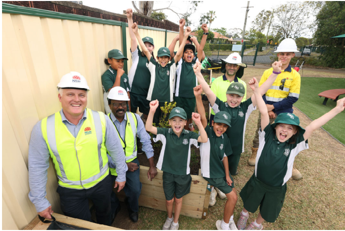
Prospect Highway upgrade team and students from Shelley Public School

The garden will be used as an additional tool in the students learning about First Nations people and how they cared for country. It will also teach the children about the importance of living sustainably and providing a connection to Country for the school.