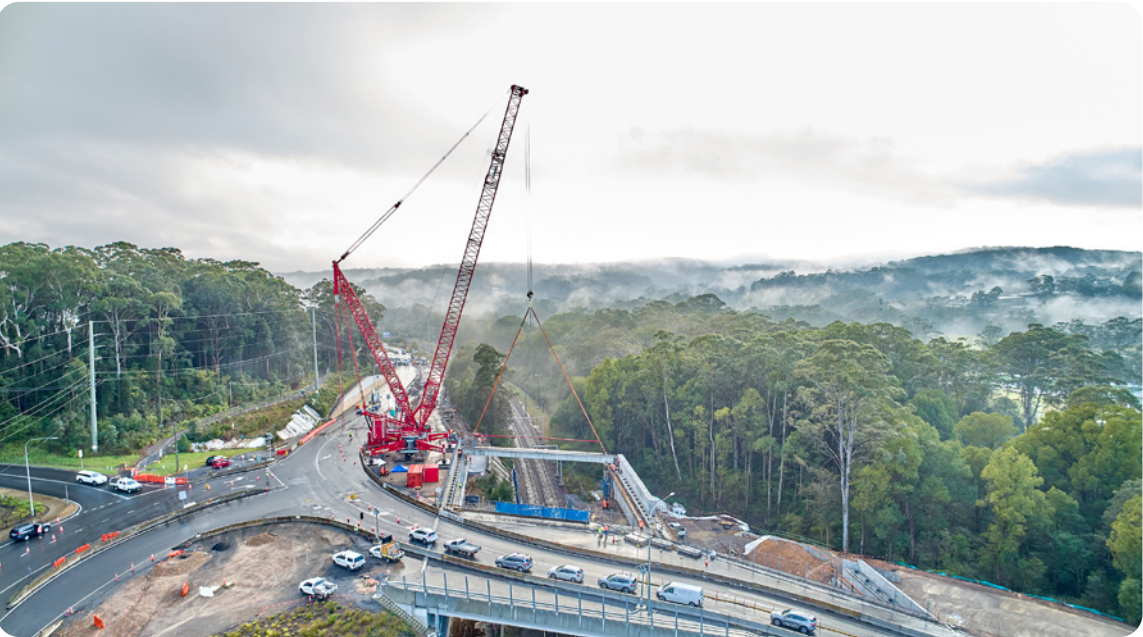
Construction of the new bridge