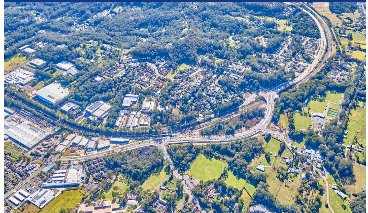
Aerial view of the project area

The NSW Government has delivered the duplication of the Pacific Highway between Ourimbah Street and Parsons Road at Lisarow.