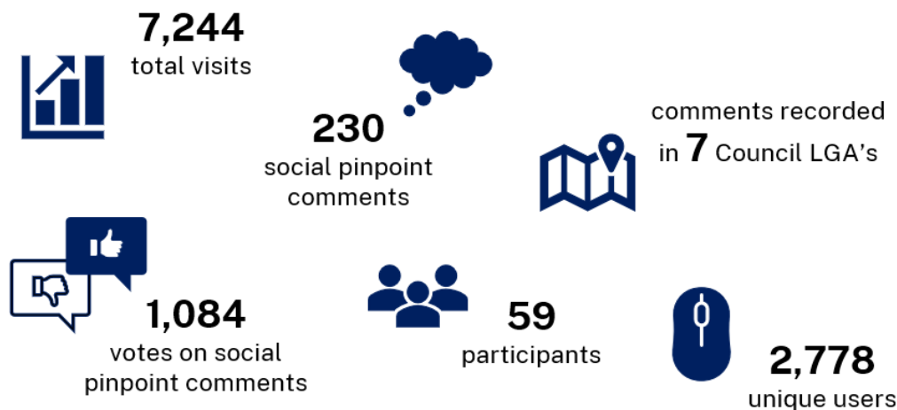
Figure 1: Parramatta to Sydney Foreshore Link consultation participation breakdown