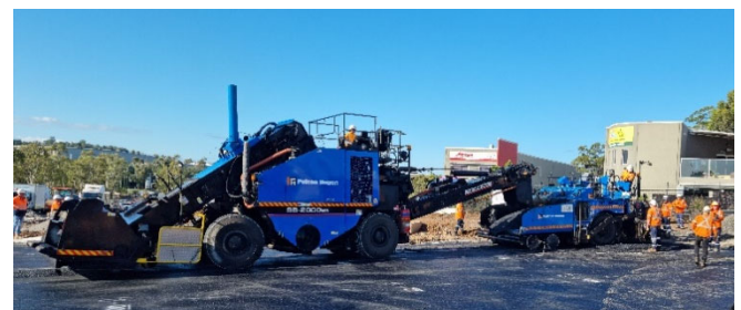
Laying permanent asphalt during recent Reservoir Road intersection shutdown.

Motorists may see changed line marking on the road once we move traffic onto the new sections of the highway. All changes will be done overnight to limit traffic effects and for the safety of our workers. Motorists should drive to conditions and follow the directions of traffic controllers and road signage.