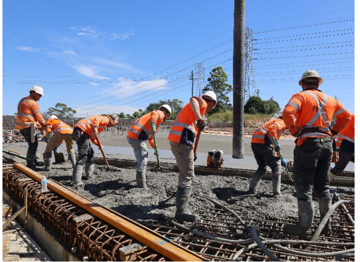
Concrete deck pour on the new M4 Bridge.

We will not be working on public holidays.