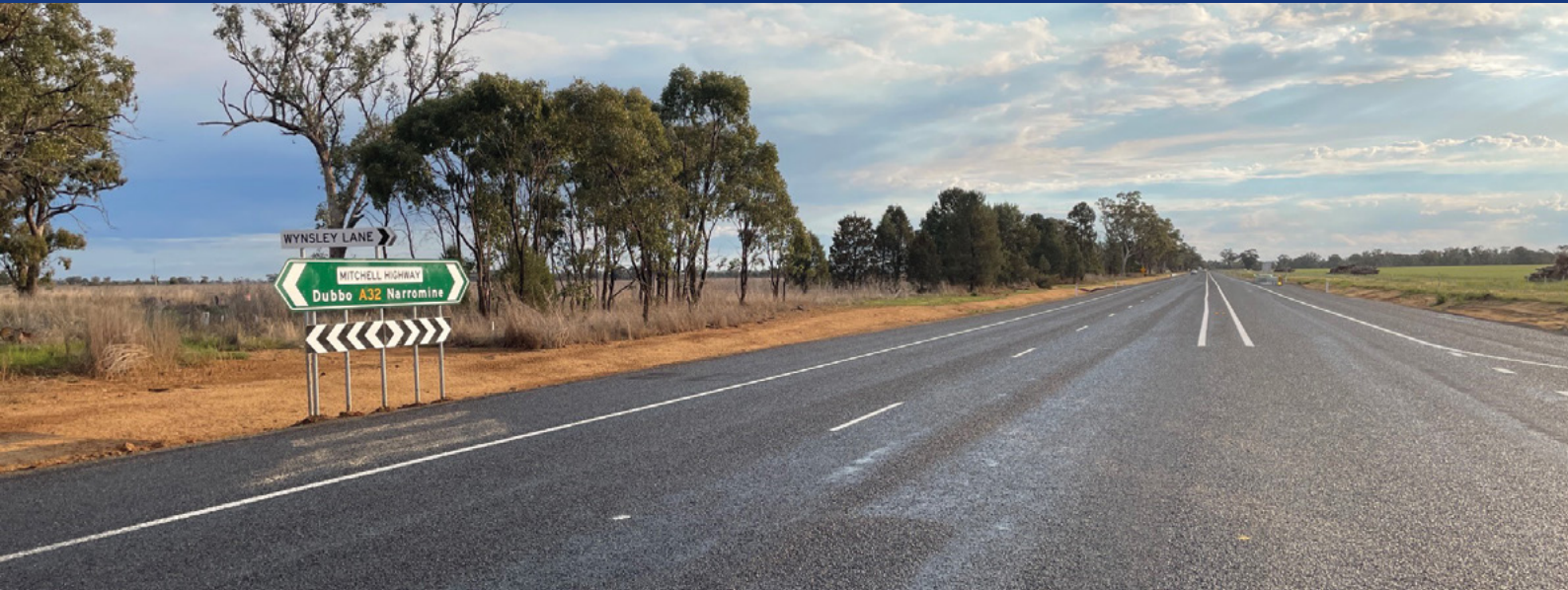
Newly finished Wynlsey Lane Westbound Overtaking Lane