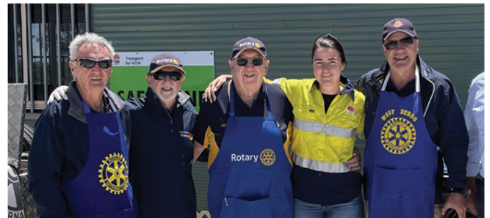
Rotary Club of Dubbo West volunteers at our December 2022 Community BBQ

Come and meet the friendly team at our next Community BBQ. For more information, visit the project webpage or email us at western.projects@transport.nsw.gov.au