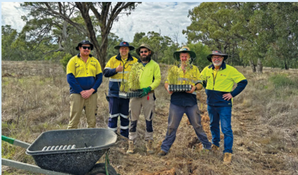
Transport for NSW project team and WestHaven working group, planting native seedlings in Crown Lands at Brummagen

In July of this year, we proudly established a partnership with Westhaven Disability Services in Dubbo. Together, we embarked on a tree planting initiative designed to balance the environmental impacts of our projects. The Westhaven team planted a total of 1440 trees over five days, which will provide enduring support to the local native plant communities. This collaboration has laid the foundation for ongoing Transport for NSW tree planting efforts.