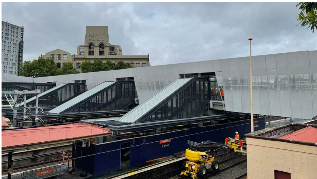
Figure 1. Photograph of weekend work on the New Southern Concourse

New Southern Concourse || Project Newsletter March 2023