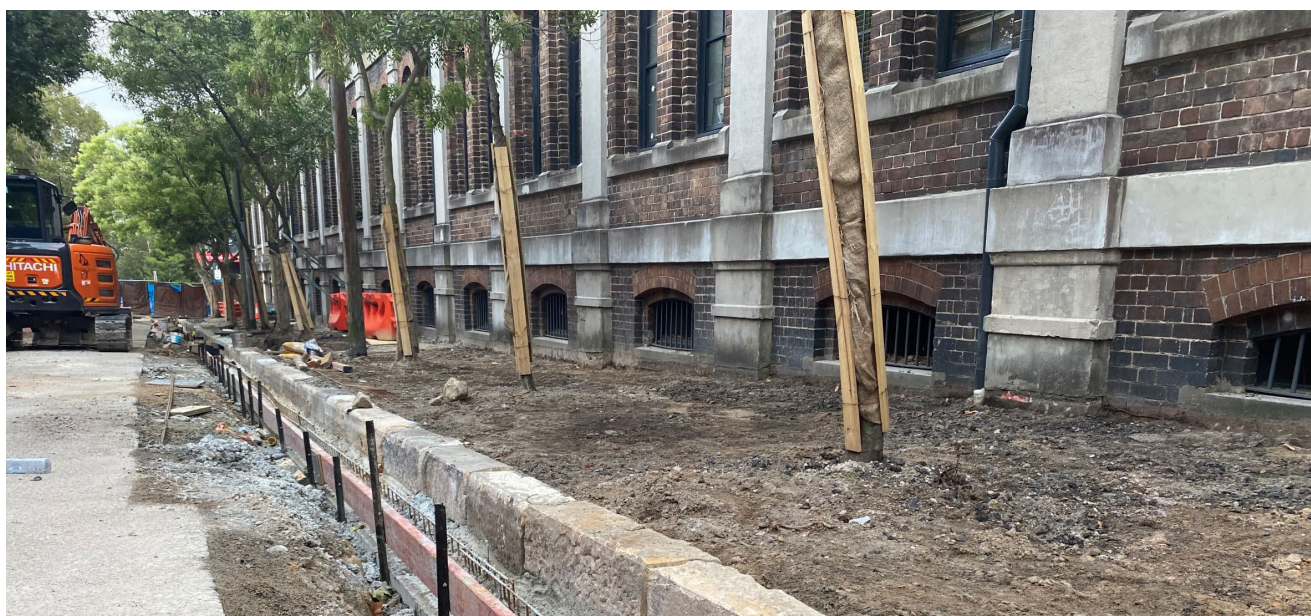
Figure 5. Ivy Street footpath widening work

As part of the work the stormwater drainage has been improved, as well as new kerbs and gutters and a wider footpath to improve pedestrian capacity and experience on Ivy Street.