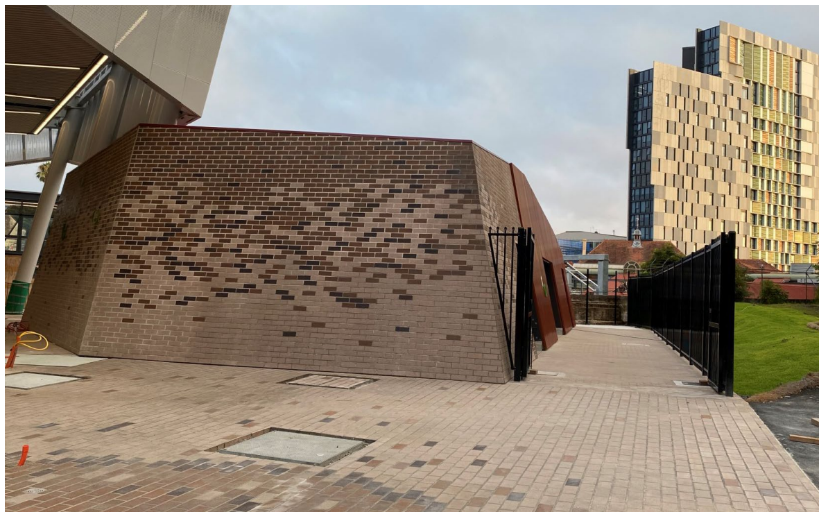
Figure 2. Marian Street entrance paved plaza and Station Services Equipment Room.

The Marian Street shared zone and the new Marian Street station entrance are nearly complete. Lights have been installed under the canopy and new streetlights installed for the shared zone.