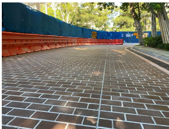
Figure 4. Marian Street shared zone