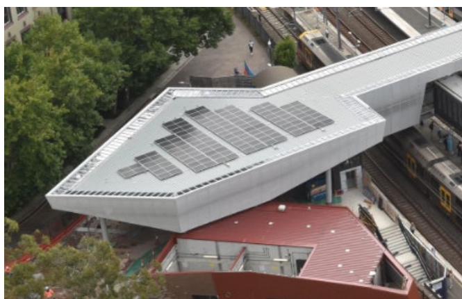
Figure 3. Solar power system on Marian Street entrance

In December, a 30 kilowatt solar power system was installed on the Marian Street entrance roof, which will provide power for station services.