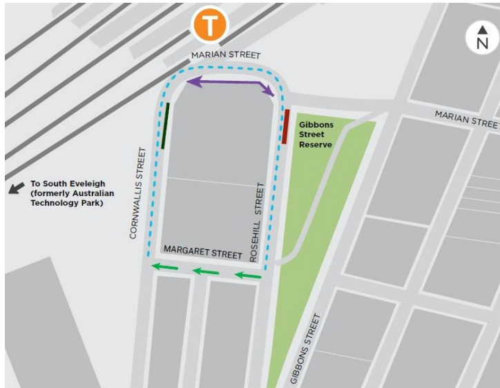
Figure 1. Temporary road access and parking changes 13 to 17 February – Marian, Rosehill and Cornwallis streets