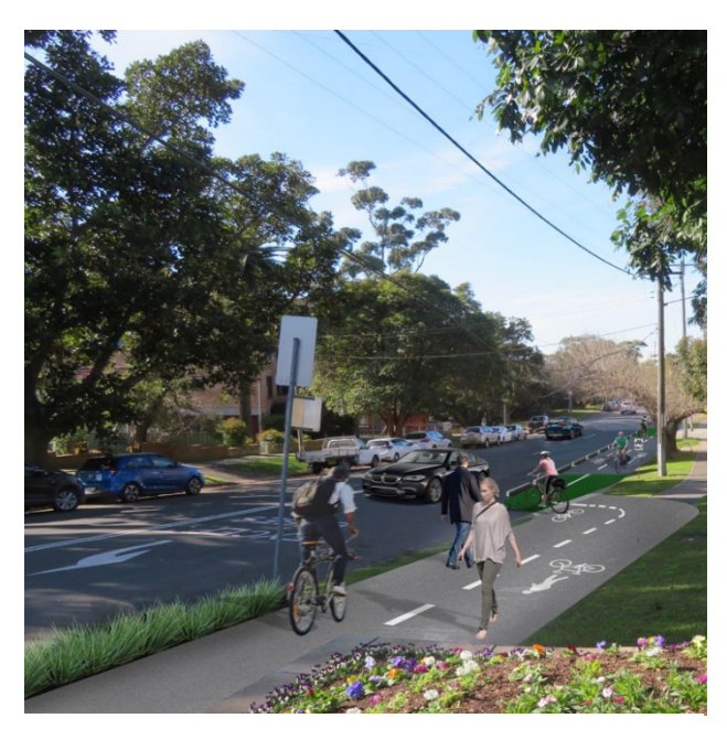
Above: Artist's impression of Stage 2 East

Our work may be noisy at times. We will work with nearby residents and provide notification ahead of work in the area and do everything we can to minimise impact.