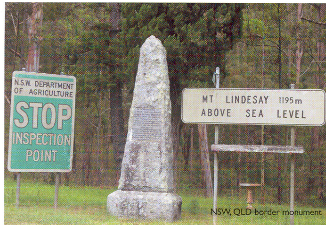
NSW, QLD border monument