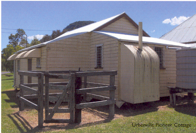
Urbenville Pioneer Cottage