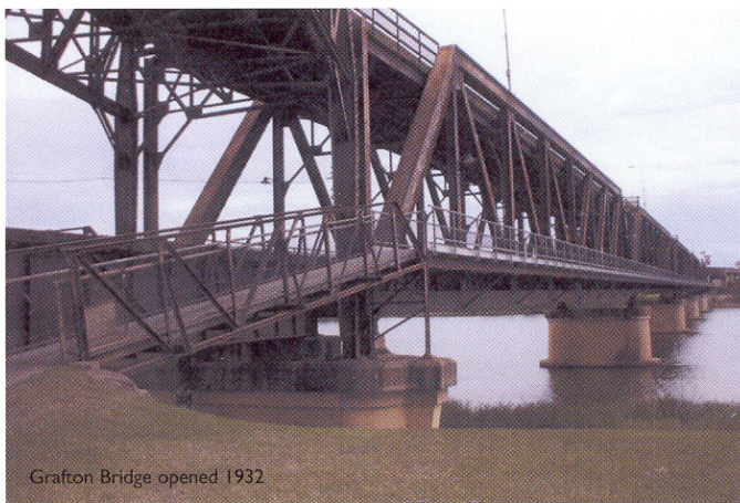
Grafton Bridge opened 1932

Koolkhan Village (17) is the site of a former coal burning power station. From Koolkhan, detour west onto the Clarence Valley Way to historic Copmanhurst Village and onto Baryulgil to join the Bruxner Highway at Tabulam.