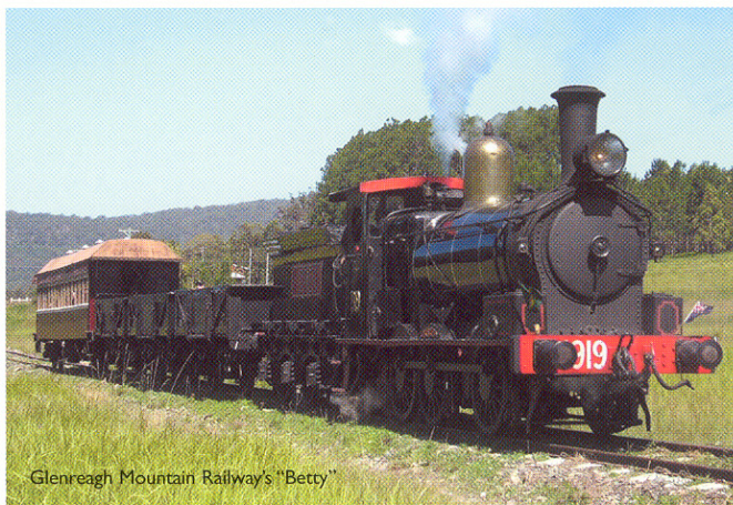
Glenreagh Mountain Railway's 'Betty'

For a scenic tourist drive, Old Glen Innes Road (20) has a 20 metre long tunnel which was constructed in 1860 by convict gangs. It is a feature of the pioneering Cobb and Co route. The path was used by timber getters, wool growers and bullock wagons as early as 1840.