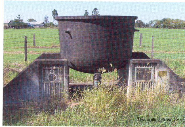
The boiling down pot