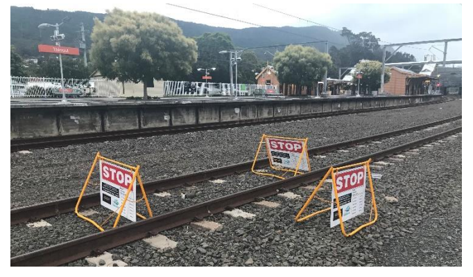
A Plover and her nest of eggs being protected by signage on the rail tracks during recent work at Thirroul Station

Recently at Thirroul, our environment team discovered a Plover (also known as a Masked Lapwing) had laid her eggs in the middle of the railway tracks. Once identified, our environment team installed signage to separate the area and ensure that no one was impacting the bird or nest. A WIRES representative attended site to relocate the eggs to a safe location. The eggs were protected for the remainder of construction activities. Following completion of our work, neither the eggs nor parents were seen during an inspection. It is assumed the family moved to a safer place away from live trains.