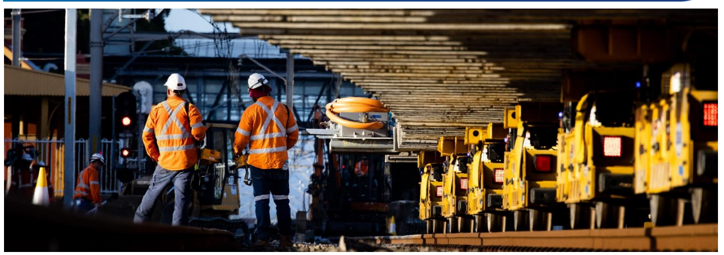
Work being completed at Wollongong Station, February 2021