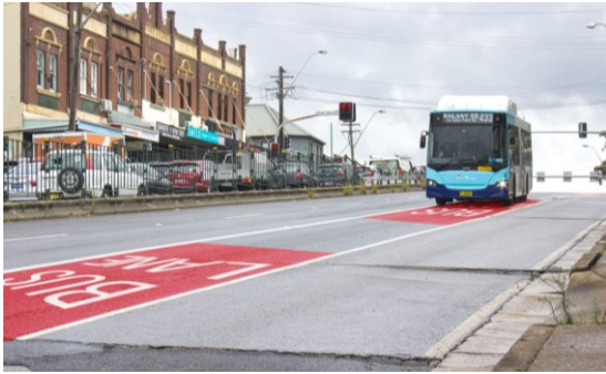
Example of an offset bus lane

Offset bus lanes operate from the second lane from the kerb. They improve bus reliability and efficiency by easing interference caused by buses stopping at bus zones and vehicles turning left along the route.