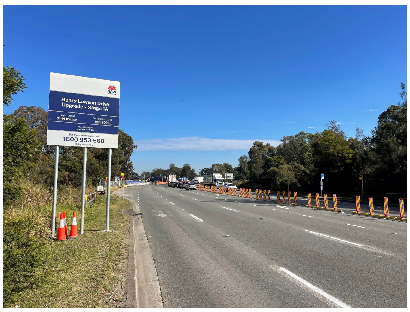
Henry Lawson Drive, Milperra

For the latest traffic updates, call 132 701, visit livetraffic.com or download the Live Traffic NSW app.