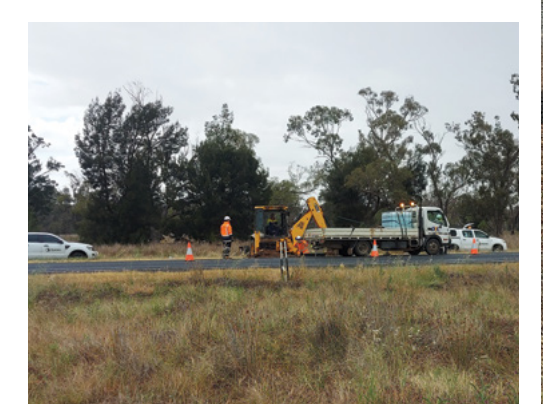
Equipment is mobilised to site