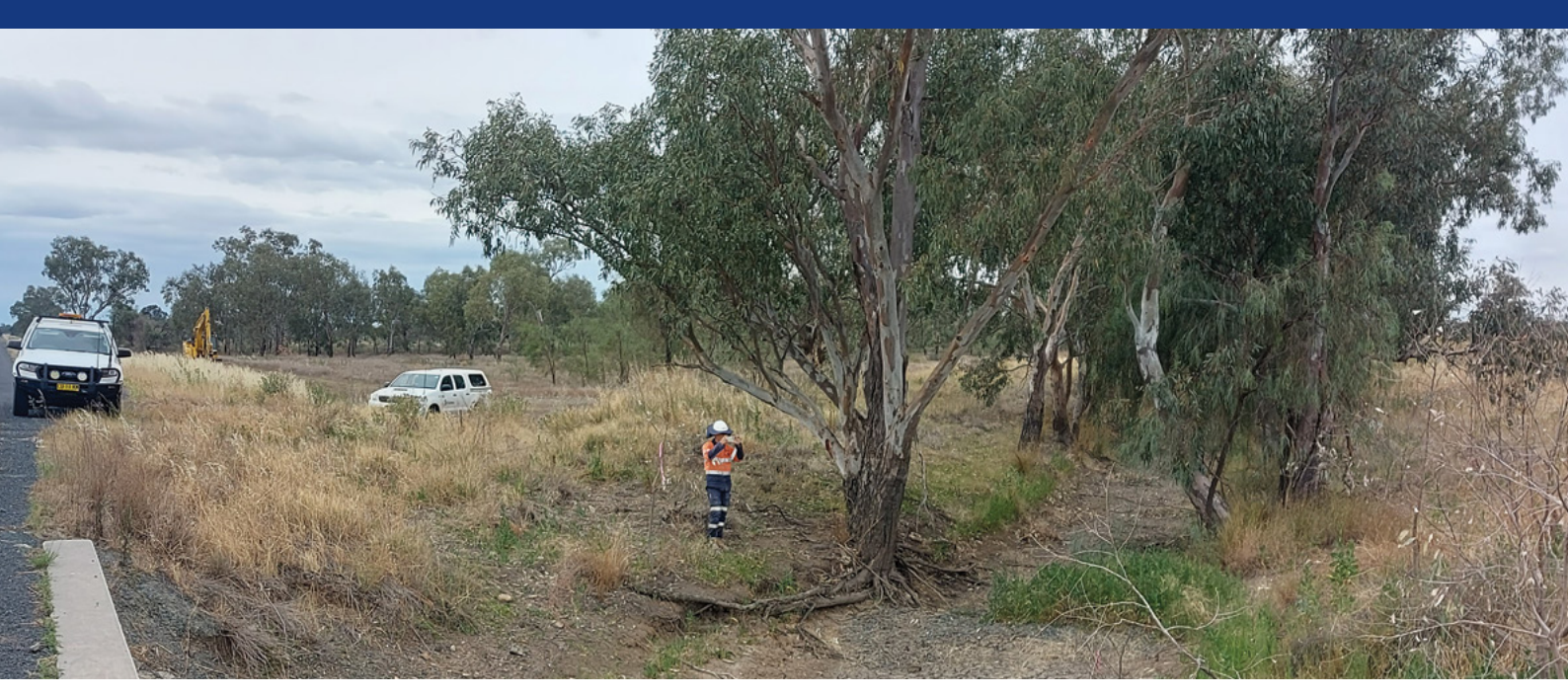
Various field investigations were carried out at Marsden in November and December 2023

The Australian and NSW Governments have committed to flood mitigation works on the Newell Highway between West Wyalong and Forbes.