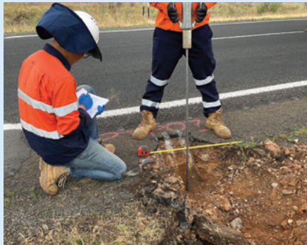
The strength of the subgrade (bottom layer of the pavement) is tested and measurements are recorded