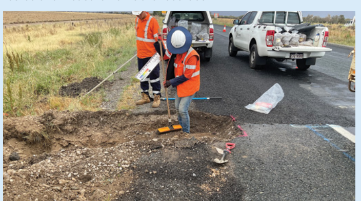
Samples are collected for laboratory testing