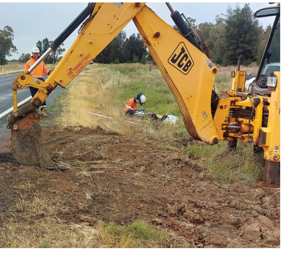
An excavator is used to dig a test pit so the existing road base can be examined