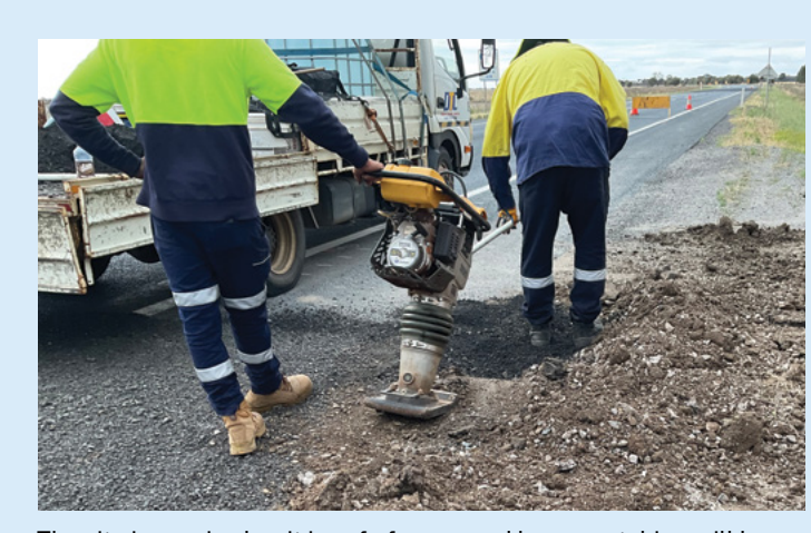
The site is repaired so it is safe for use and heavy patching will be applied during routine maintenance