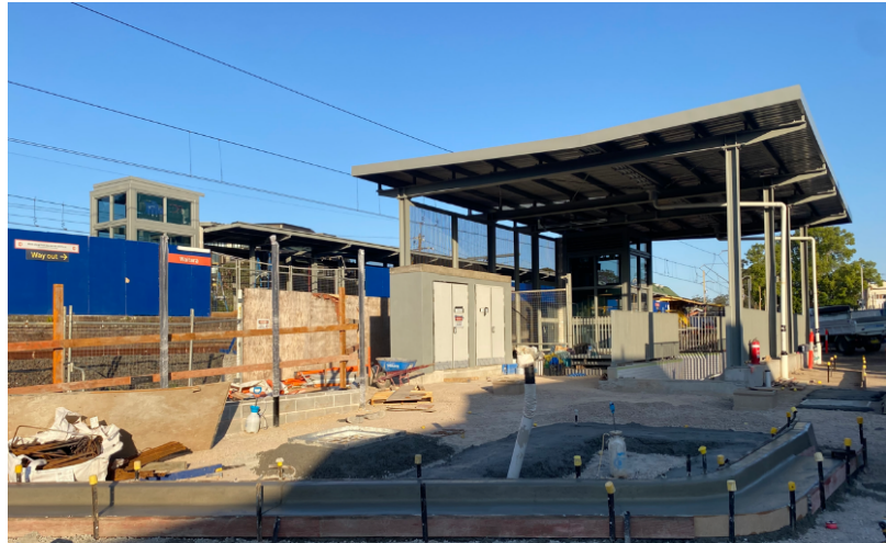
Construction progress image. Above: New station forecourt under construction including raised planter bed, bike parking, bollards and paved finish.