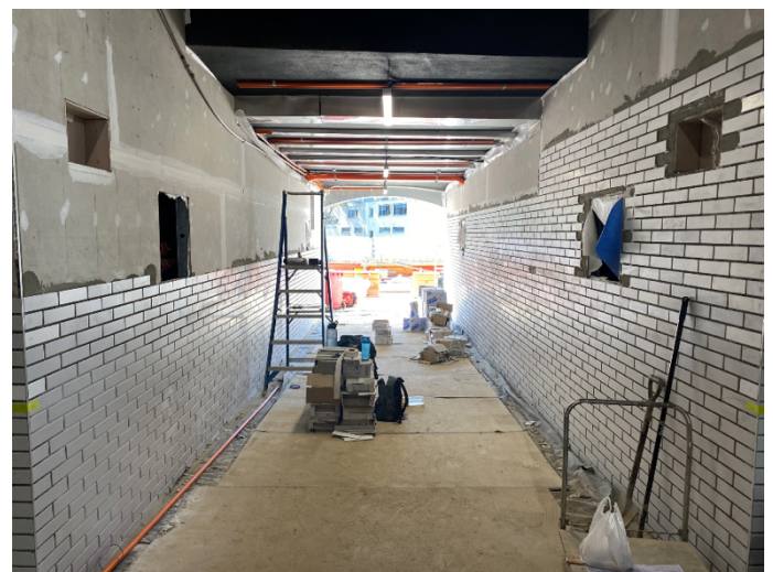
Above: Tiling work underway within the new station underpass, August 2023.