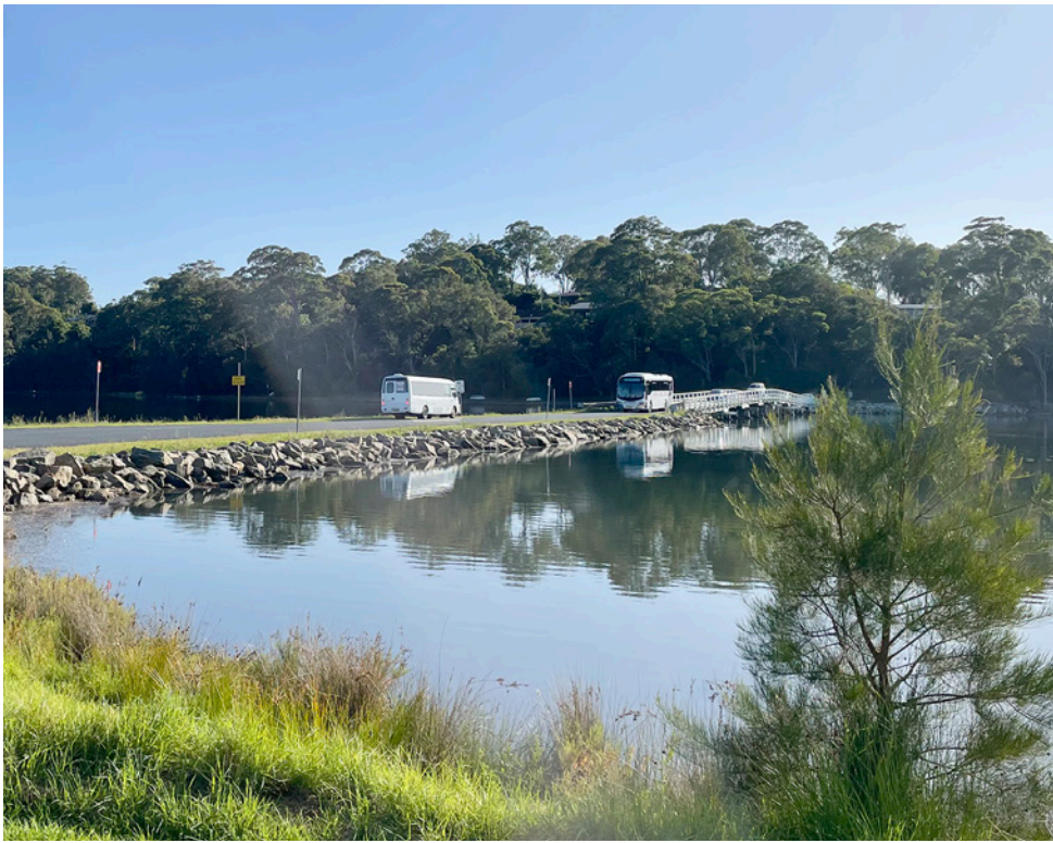
Looking north at Wallaga Lake Bridge