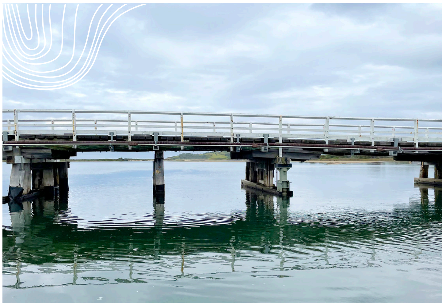
Looking east at Wallaga Lake Bridge

Transport for NSW will carry out major work on Wallaga Lake Bridge to repair the local icon. This essential maintenance work will ensure the bridge is safe well into the future for the local community and everyone who uses it.