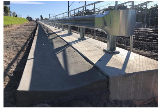
Construction progress on the retaining wall at Waterfall Station