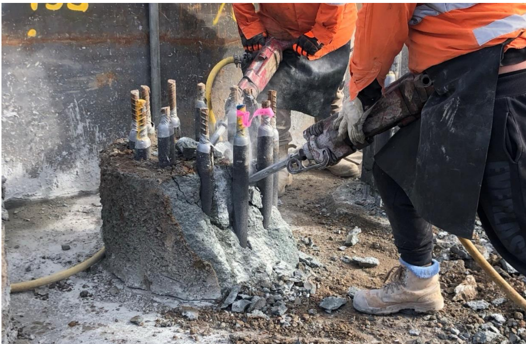
Enabling work at Waterfall Station

This work is expected to take two years to complete and we are committed to working closely with our customers, local residents, businesses and station staff during construction.