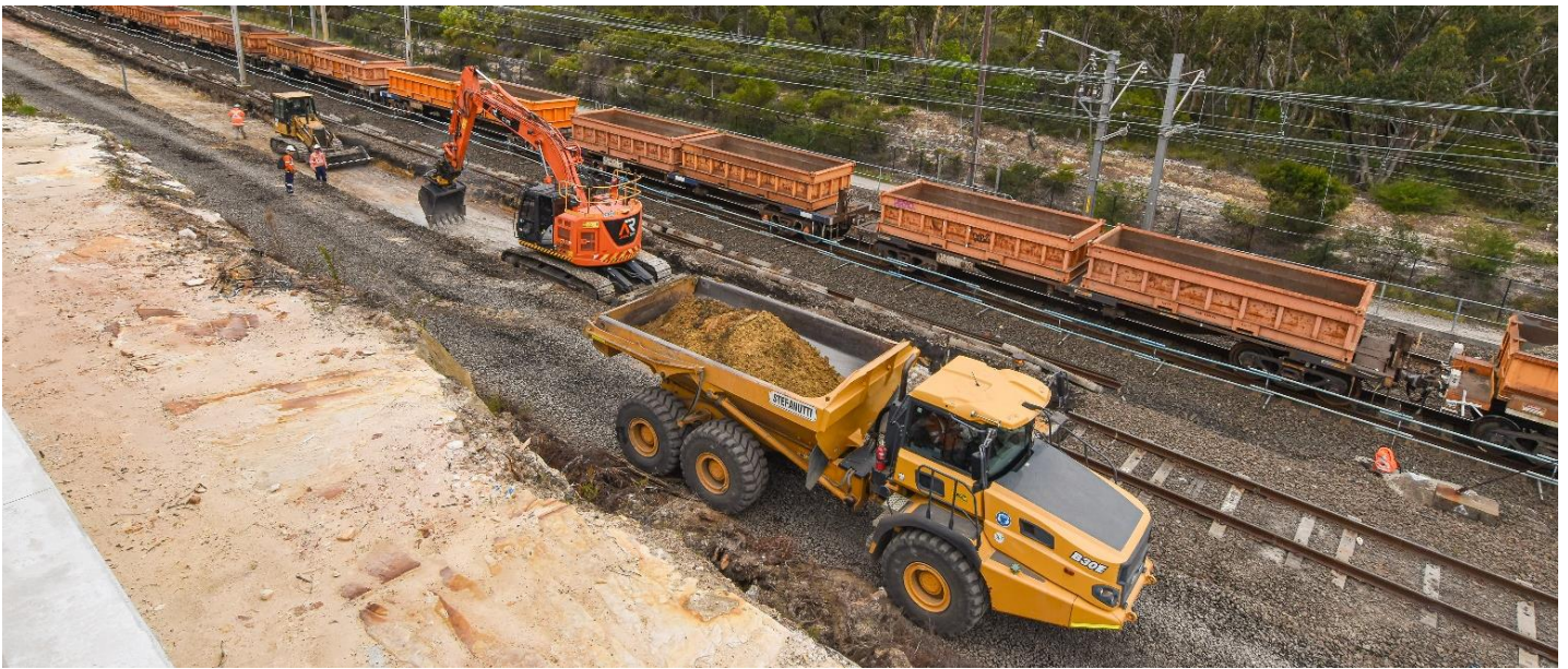
Working in the rail corridor at Waterfall – December 2020