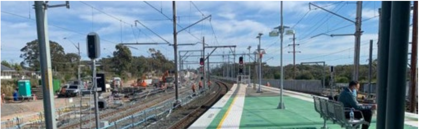
Photo of Waterfall Station, taken in October 2021. This image shows the temporary modular platform (green surface) which we remove and re-instate to enabling foundation construction for the new staff footbridge.