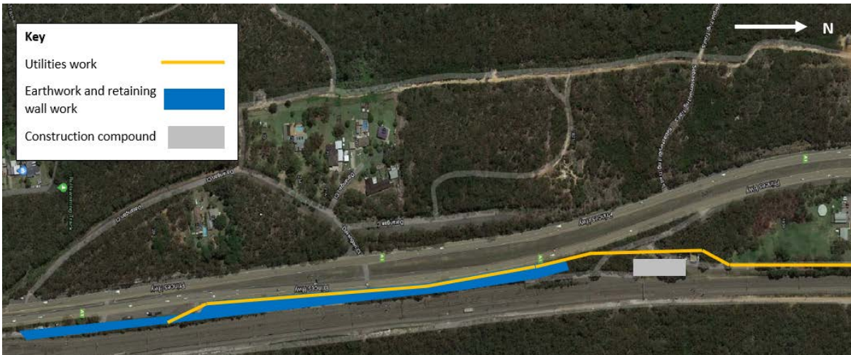
Image 1: Map showing locations of Abergeldie utility work, earthwork and retaining wall work.