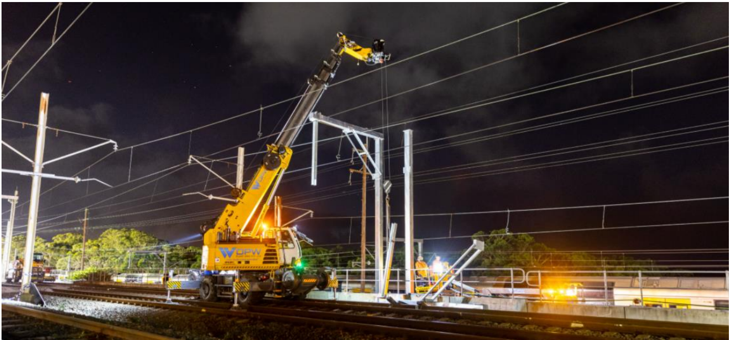
Overhead wiring work taking place at Waterfall in February 2021