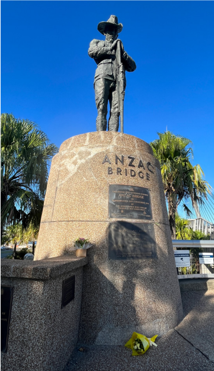
Digger statue on the Anzac Bridge

Work to refurbish the statues will begin in the coming months.