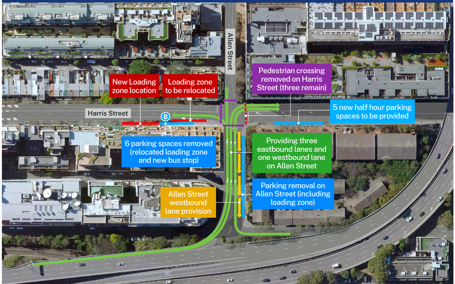
Parking changes at Allen Street and Harris Street intersection, subject to further community consultation

Implementation of this bus stop change is subject to further community consultation in the coming months.