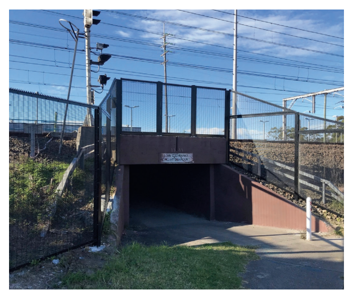
New fence at the Coniston pedestrian subway

Over the next 10 years the More Trains, More Services program will simplify and modernise the rail network so that customers can expect more frequent train services, with less wait times, less crowding and more seats on a simpler, more reliable network.