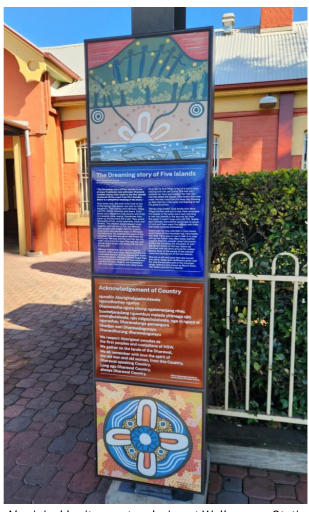
Aboriginal heritage artwork sign at Wollongong Station.