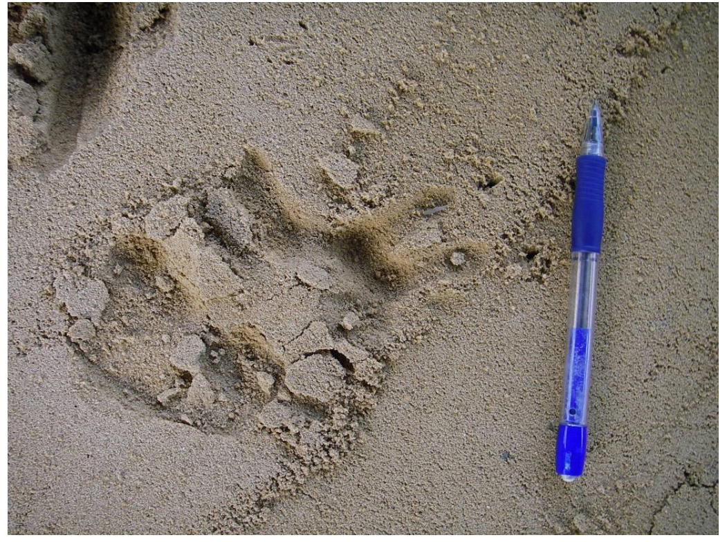
Plate 2: Koala track recorded at the Middle Creek underpass on 25 November 2009.