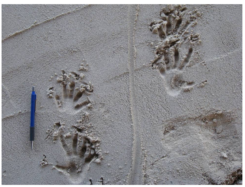
Plate 4: Goanna track recorded at the Reedy Creek underpass.