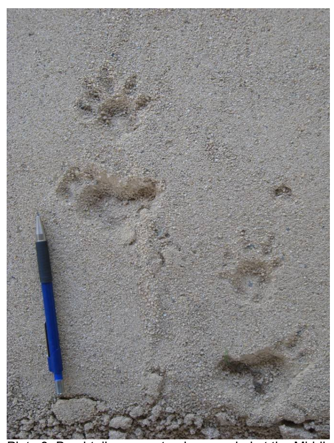
Plate 3: Brushtail possum tracks recorded at the Middle Creek underpass.