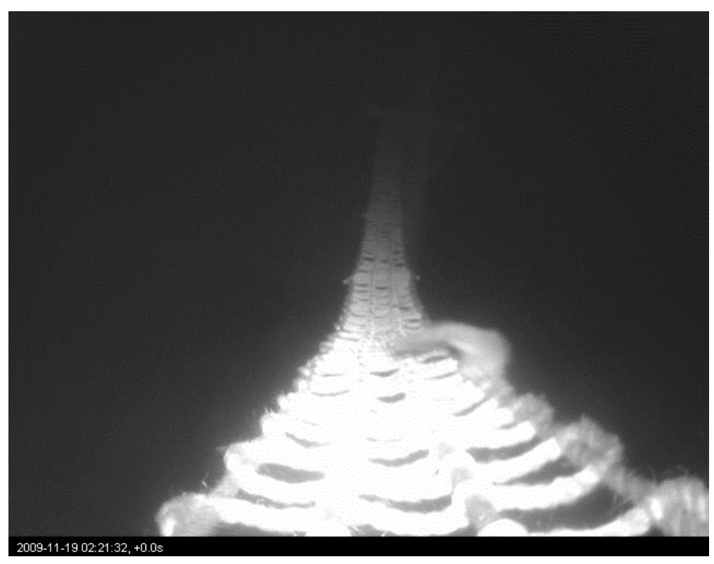
Plate 5: Sugar Glider photographed from the western camera.