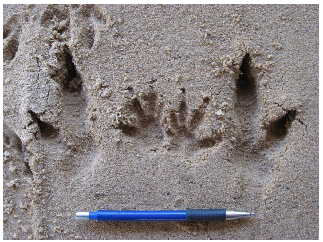
Plate 1: Wallaby track (probable Swamp Wallaby) recorded at the Bonville Creek underpass.