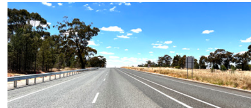
Completed northbound overtaking lane at Bundiggerry Road

Transport for NSW acknowledges the Wiradjuri People and pays respect to those Traditional Custodians of the lands on which we work, especially Elders, past and present and to emerging community leaders. We recognise and celebrate the diversity of Aboriginal and Torres Strait Islander people and their ongoing cultures and connections to the lands, waters, and skies.