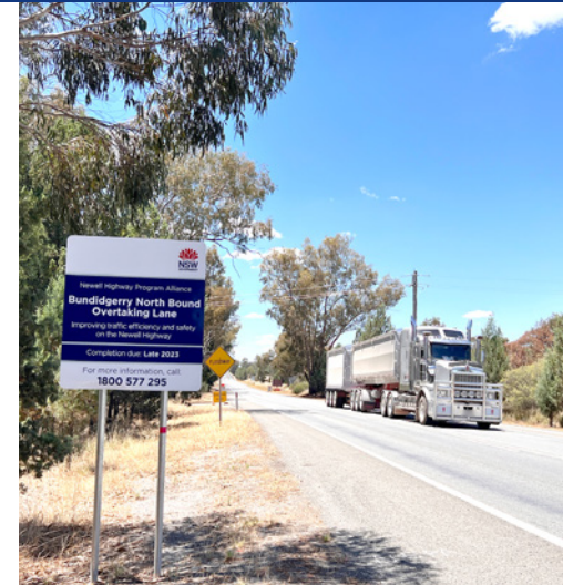
Completed northbound overtaking lane at Bundidgerry Road

We thank you for your patience during these works.