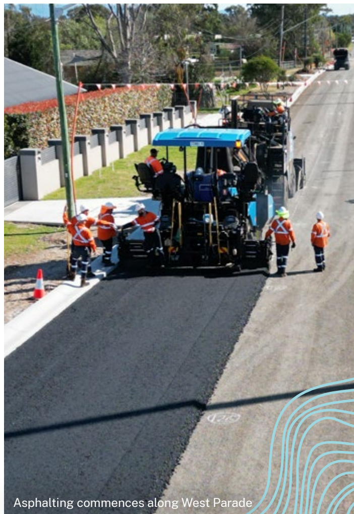
Asphalting commences along West Parade

For the latest traffic updates, you can call 132 701, visit livetraffic.com or download the Live Traffic NSW App. Thank you for your patience while we make these improvements for your community.