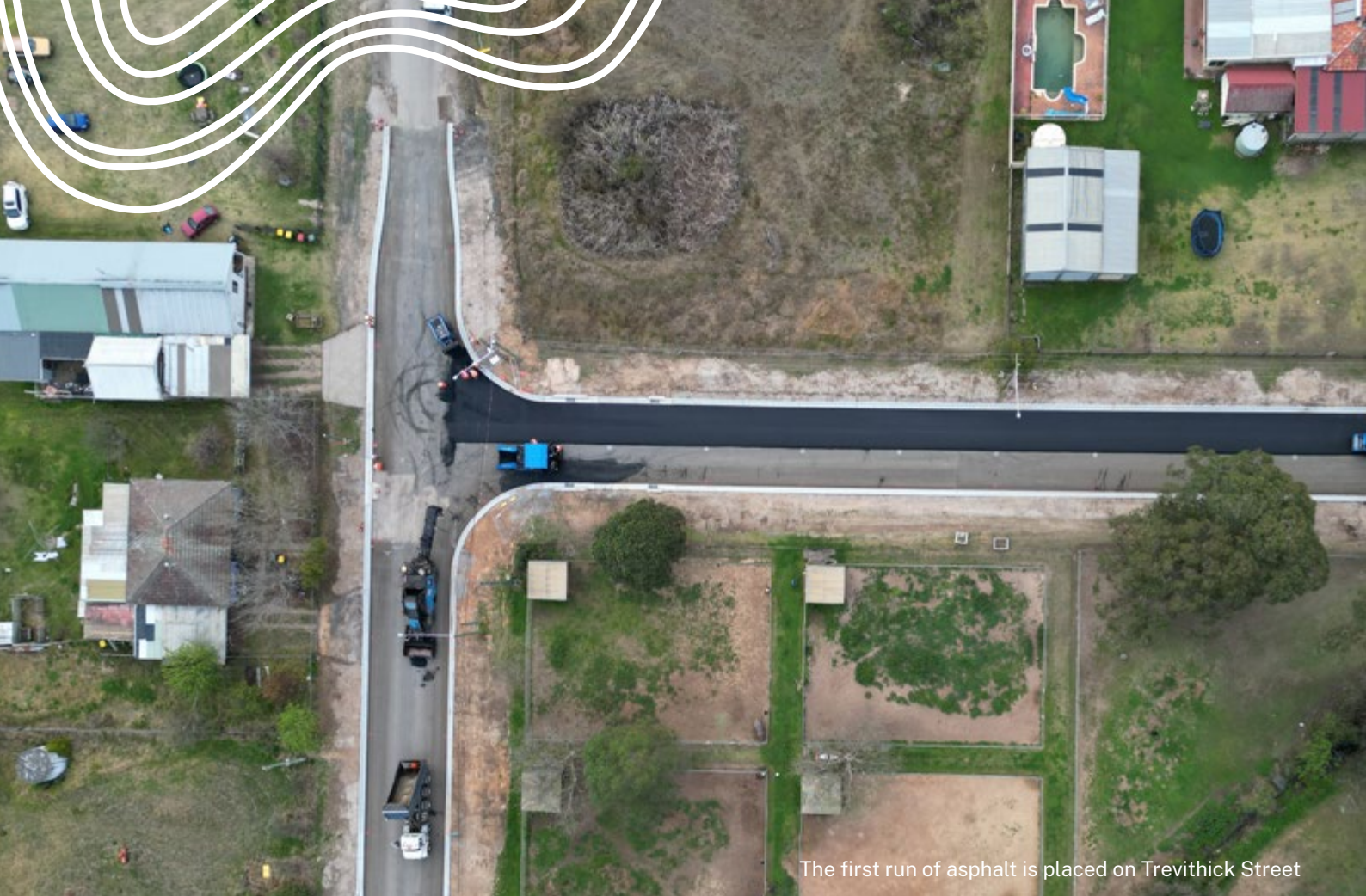
The first run of asphalt is placed on Trevithick Street