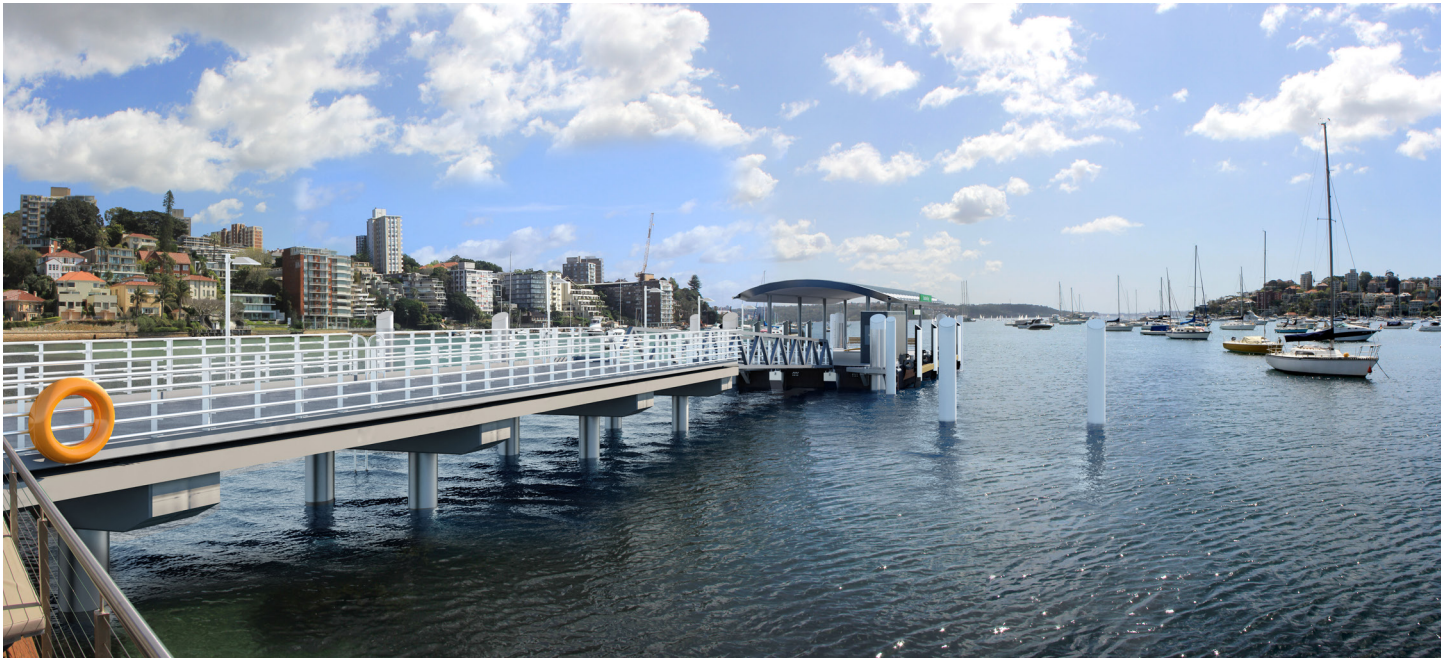
Artist's impression of the Double Bay Wharf Upgrade (for illustrative purposes - note the existing jetty is no longer being replaced)