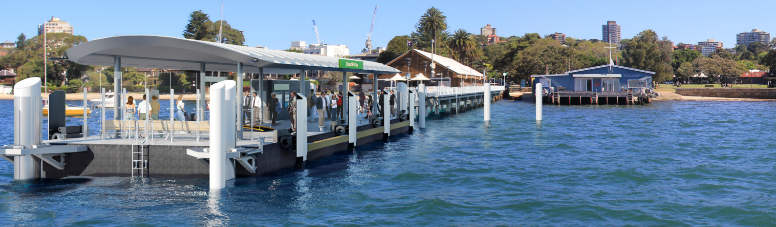
Artist's impression of the Double Bay Wharf Upgrade (for illustrative purposes)

The NSW Government is upgrading Double Bay Wharf as part of the Transport Access Program – an initiative to deliver modern, safe and accessible transport infrastructure across the state.