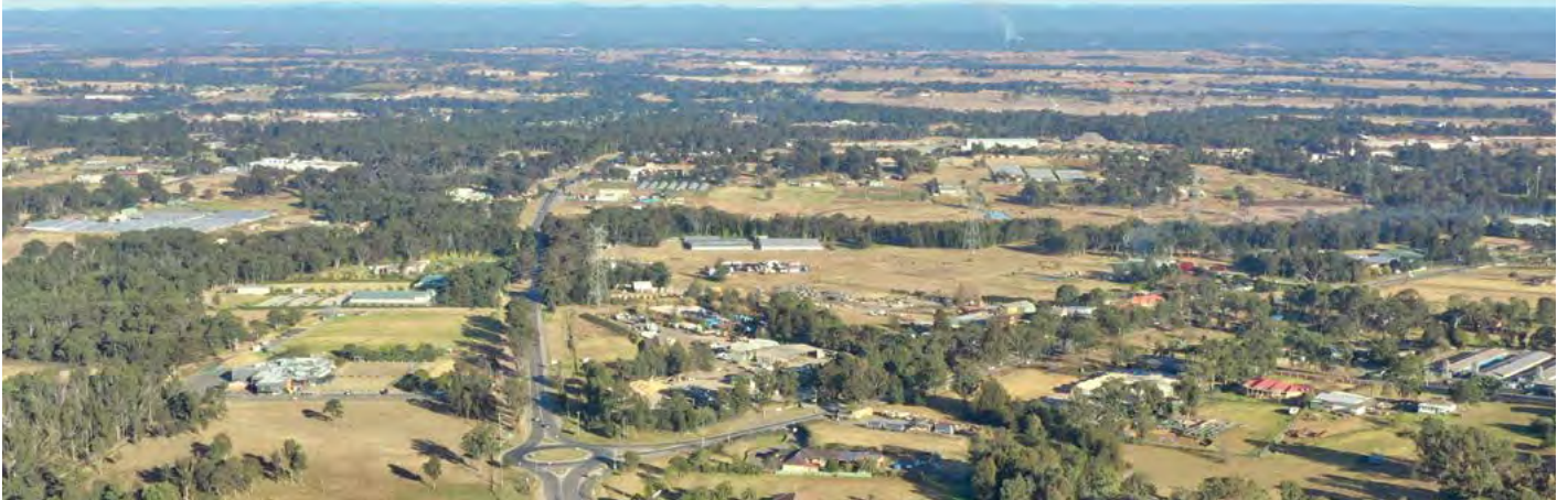
Elizabeth Drive and Mamre Road intersection looking west

To support future growth in Western Sydney