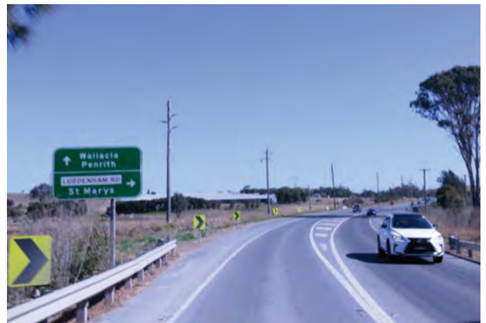
Elizabeth Drive looking west towards Luddenham Road intersection

Feedback is invited by Thursday 9 April 2020 .