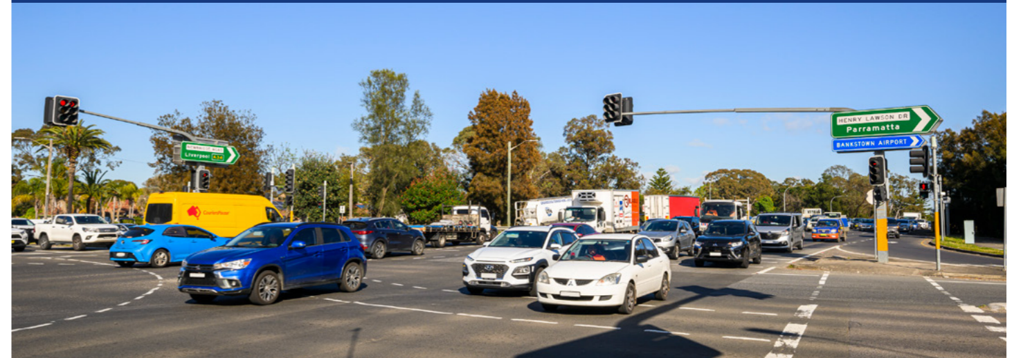
Northeast corner of Henry Lawson Drive and Milperra Road

Transport for NSW is upgrading Henry Lawson Drive Stage 1A, between Tower Road, Bankstown Aerodrome and Auld Avenue, Milperra.