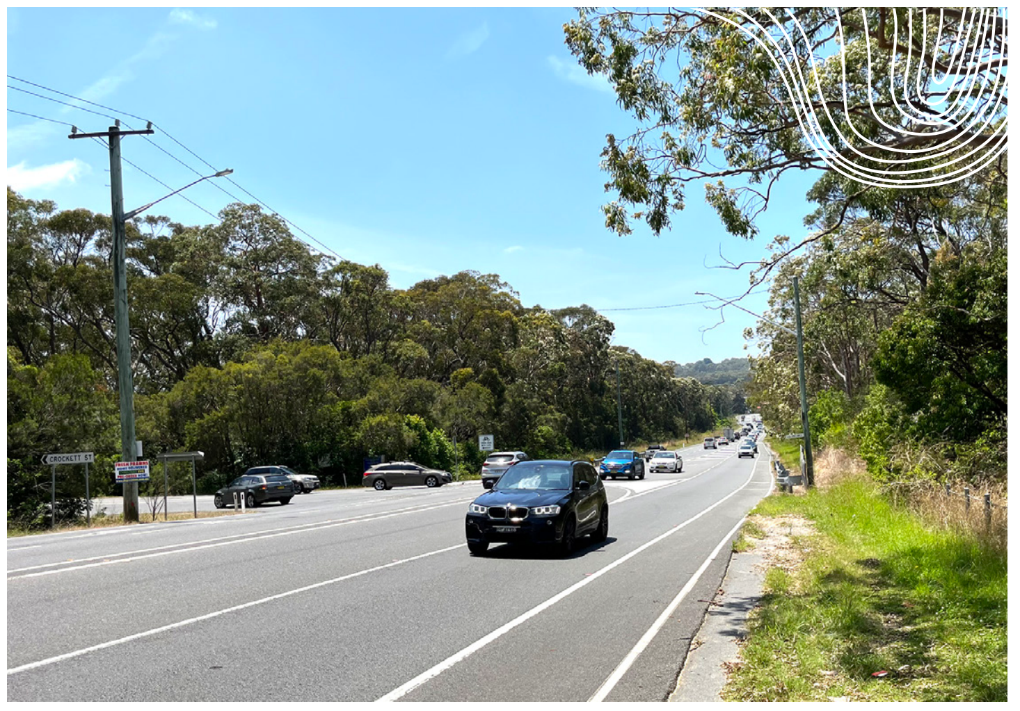
Hillsborough Road looking east

Transport for NSW (Transport) is planning to upgrade Hillsborough Road from the Newcastle Inner City Bypass roundabout to the existing duplication west of Crockett Street. Around 35,000 motorists use Hillsborough Road daily and this upgrade would improve traffic flow, safety and accessibility for all road users.