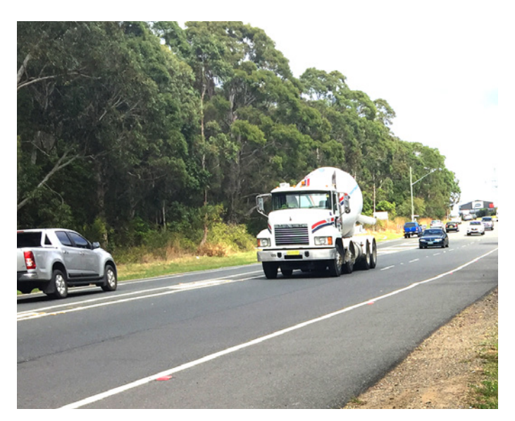
Hillsborough Road looking west