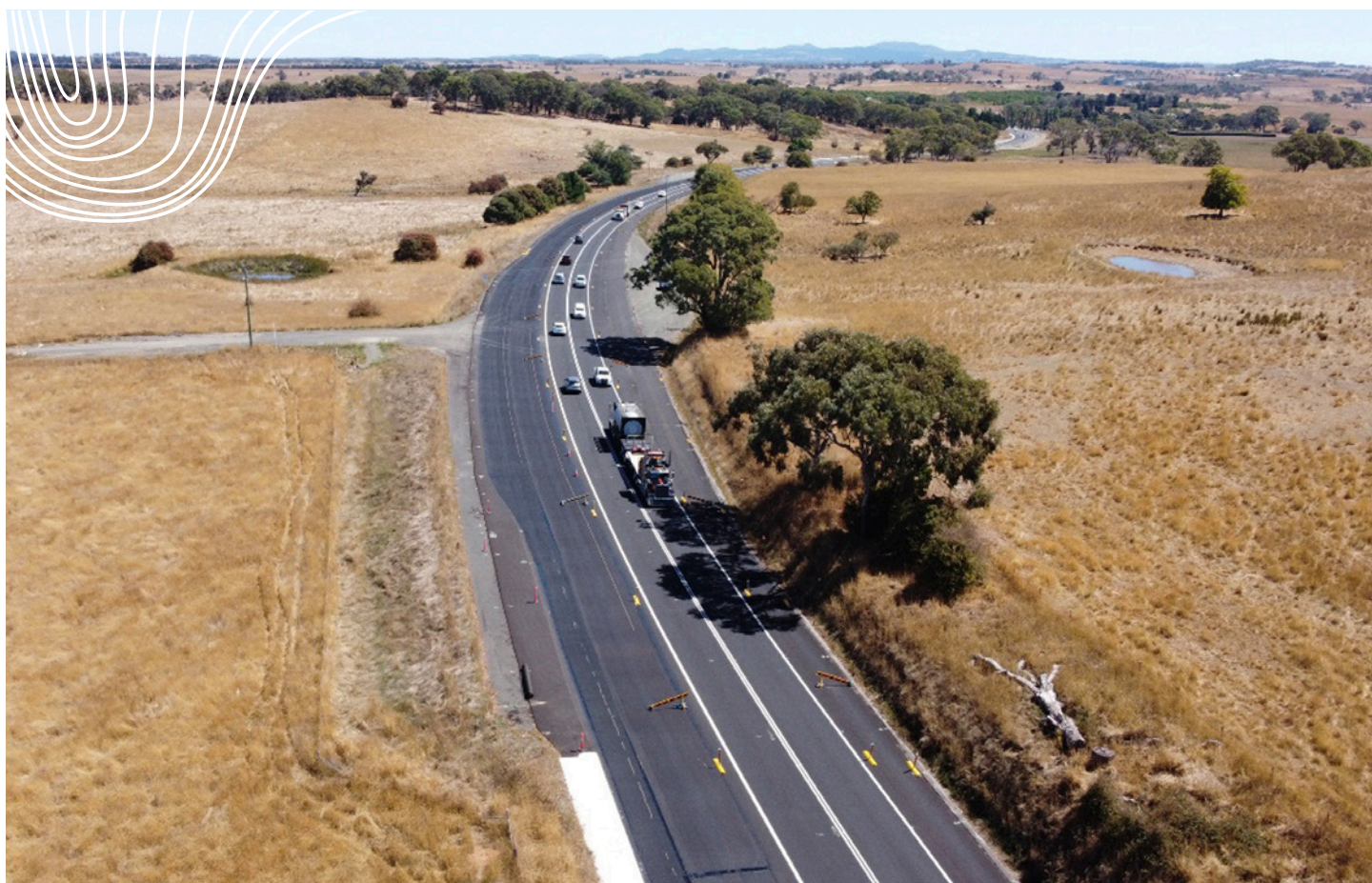
New asphalt at the East Guyong project on the Mitchell Highway

What a huge year it's been on the Mitchell Highway between Bathurst and Orange. Transport for NSW has been improving safety along a 50 kilometre section of the highway for the past few years with a number of projects now complete. The latest sections complete and now open to traffic include Vittoria East and East Guyong following the completion of Guyong in 2022.