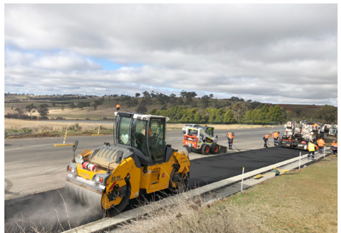
Asphalt works completed