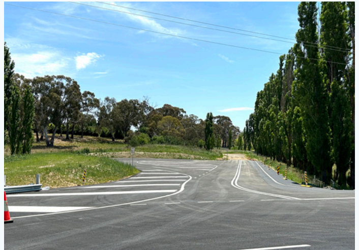
The B-double turnaround bay off Gordon Road