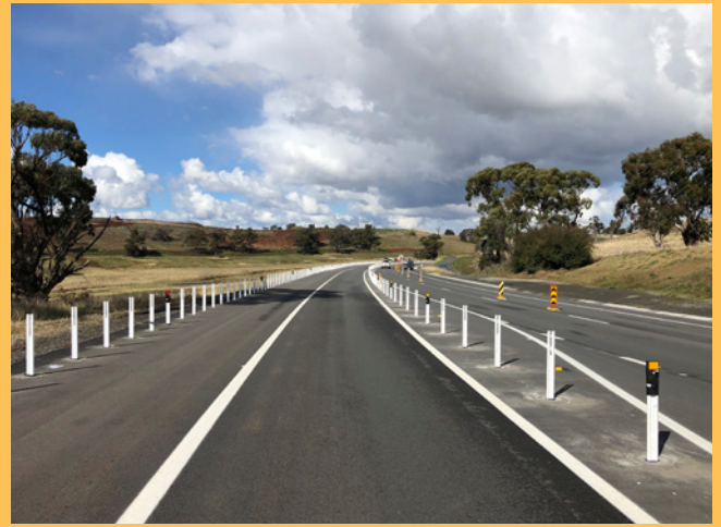
Flexible safety barriers at Guyong

Transport for NSW thanks the community for their patience during these important safety works.