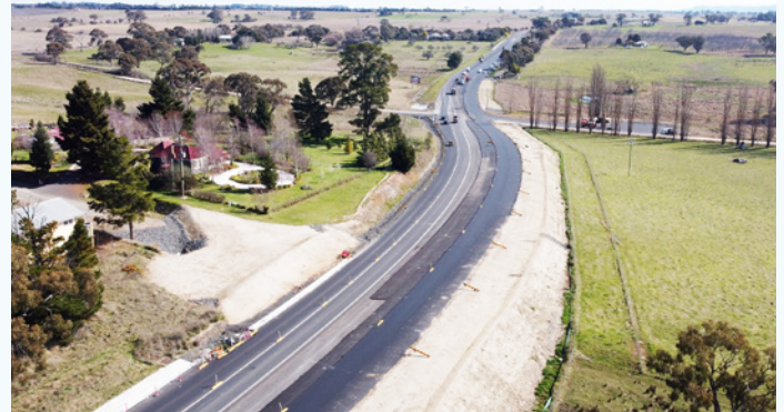
East Guyong -before and after. Photos taken from Fenton Road looking West towards Orange.