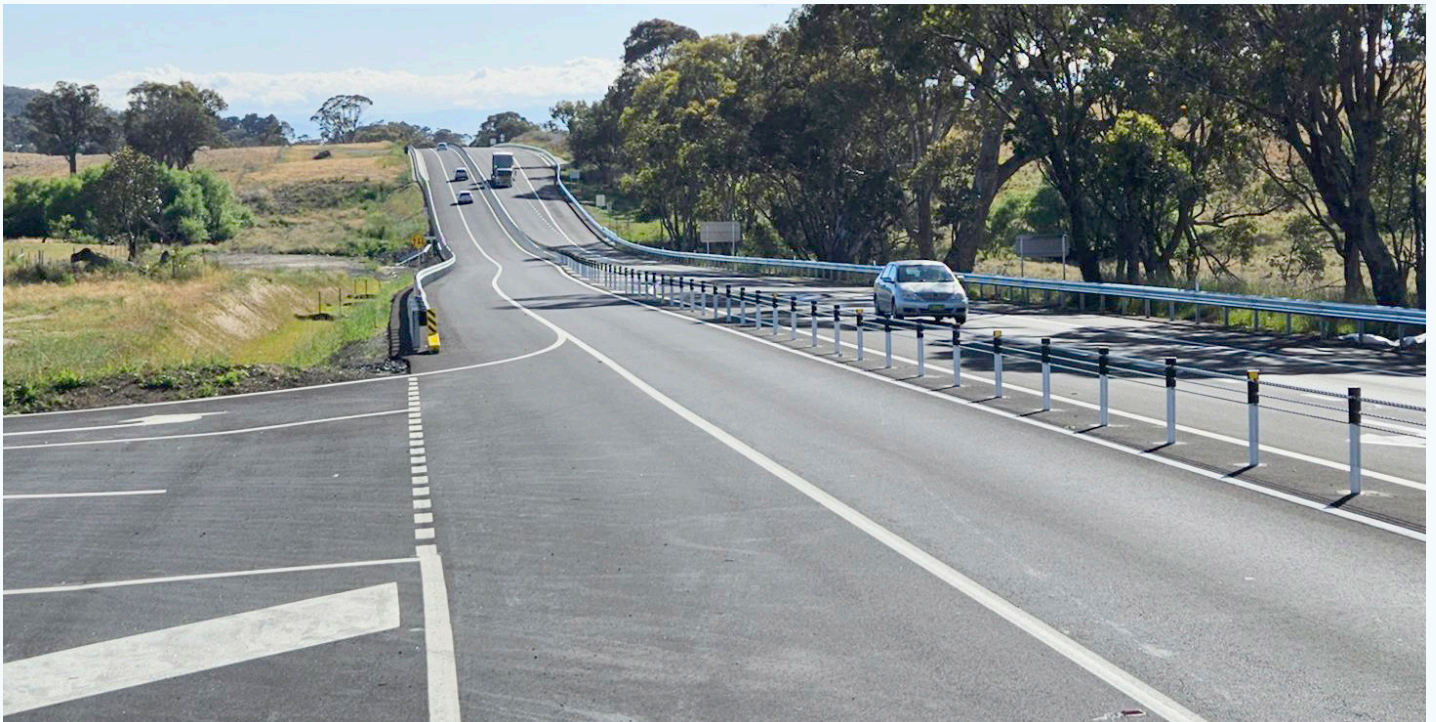
Safety work on the Mitchell Highway at Vittoria Curve

We have three safety projects in the Vittoria area to combat the high rate of crashes