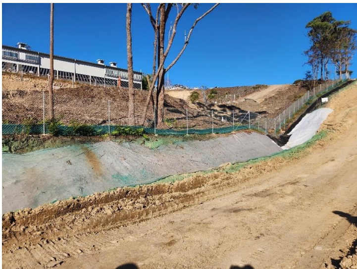
Image 7: Eastern boundary with JHH. Works above the fence are JHH, works below the fence are RP2J. Note clean water perimeter drain, soil binder and batter protection.