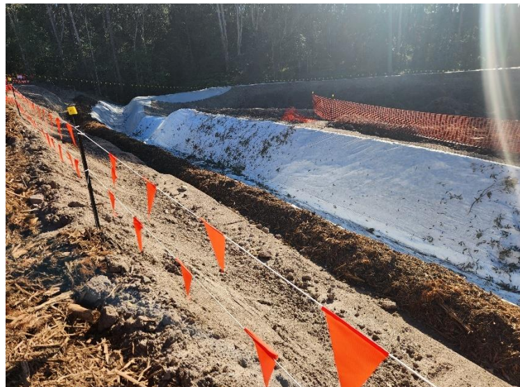
Image 4: Creek Diversion, looking east. Waterway WC2 – Unnamed ephemeral tributary of Dark Creek (2016 RP2J EIS p465).