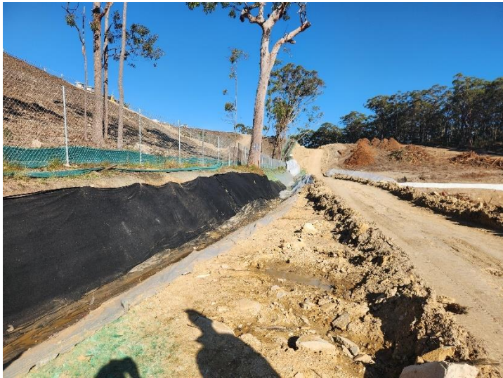
Image 5: Eastern boundary (JHH) lined clean water perimeter drain.