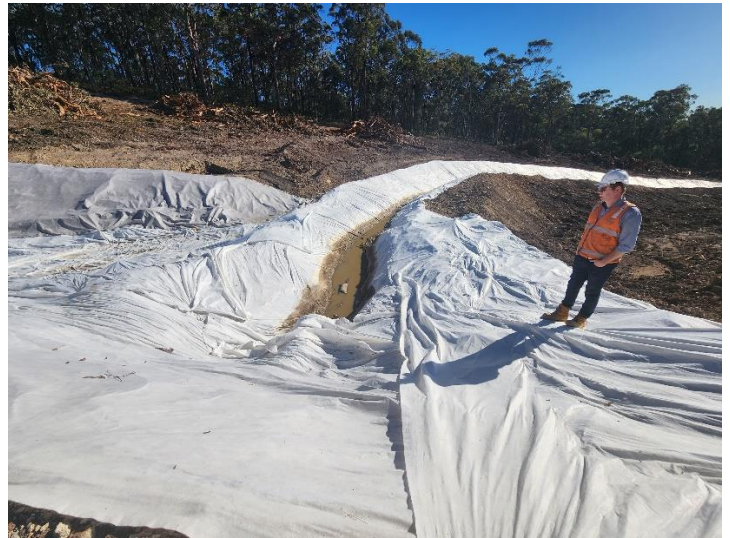
Image 6: Clean water drain collecting the eastern boundary (JHH) perimeter water and taking it off site to the west.