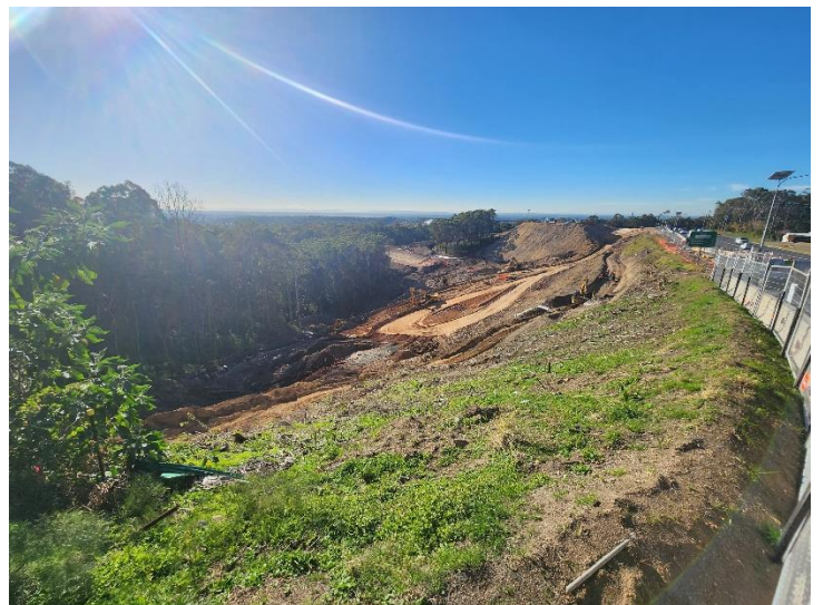
Image 8: View of the southern interchange works, looking north from Lookout Road.