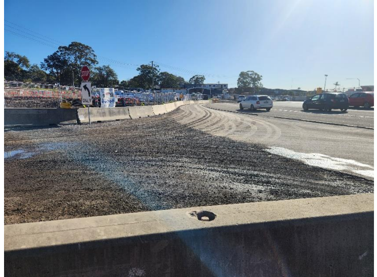
Image 2: Slip Lane entry / exit from the Jesmond site for heavy vehicles (not for public use). Looking west.