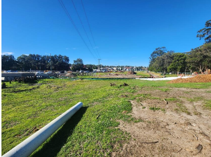
Image 1: Looking east across Jesmond Park from the Jesmond Compound Site.