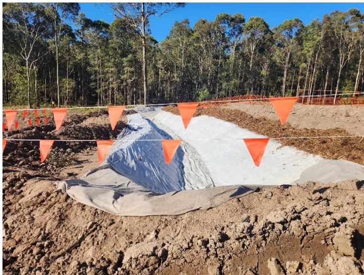
Image 3: Creek Diversion, looking west. Waterway WC2 – Unnamed ephemeral tributary of Dark Creek (2016 RP2J EIS p465).