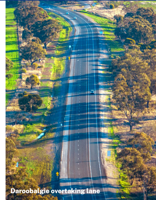
Daroobalgie overtaking lane

Work on the Daroobalgie overtaking lane started in May 2022 and through effective traffic management measures, delays to motorists were reduced to less than five minutes during construction.